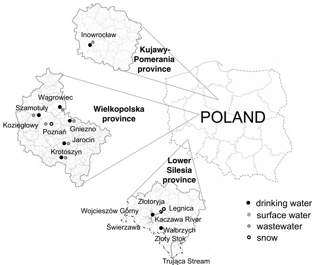
Fig. 1 Sampling map of study area

inorganic ions ( Ca^{2+} , Mg^{2+} , Na^+ , K^+ , Cl^- , SO_4^{2-} , PO_4^{3-} , NO_3^- ) concentration. Results regarding water quality parameters and basic anions and cations were partially provided by water treatment stations or municipal sewage treatment plants, from where some of the samples had been collected. For measurements aiming at the determination of total arsenic concentration, samples were acidified with 125 \mu L of nitric acid (suprapur nitric acid of 65 % (v/v)) on each 125 mL of sample. However, for arsenic speciation analysis samples were immediately frozen and thawed just before the analysis. Samples were then filtered through syringe filters with a pore size of 0.45 \mu m. The snow samples (Lower Silesia province and Wielkopolska province) were collected to the polyethylene bottles with use of polyethylene spatula. They were taken from the surface and 2 cm deep into the snow layer, so not only the dark layer of the atmospheric dust but also clean snow underneath was collected. After the