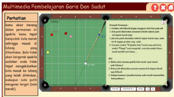
Figure 3. Display of the game

When a student selects the material button, some material choices are displayed, the presentations of the materials are almost the same. At the initial stage the students are given an illustration in the form of pictures related to the material, then on the next page, the student will be given problems, to help in finding concepts of a particular material. If the student does not know the material, he or she can see the illustration of the material which is presented in an instructional media. However, when he or she has understood it, on the following page he or she will be given a comprehension test, the display of each of the pages can be seen in Figures 4,5, and 6.