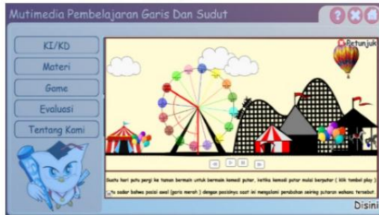
Figure 5. Display of instructional media