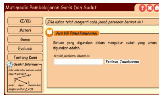
Figure 6. Display of a comprehension test

In various sub-materials, the student is given a problem in the form of short completion to test his or her deeper understanding. Different from the problems in the comprehension test, which only present a consequence of the student's answers, whether the student is wrong or right in answering the problems given, the problems on the conclusion page contain feedbacks when the student fails to answer the problems, so that he or she is directed to find the answers by clicking the button Cari Tahu jawabanya to help him or her to find the answers to the problems that he or she could not answer correctly. To get clearer information, see the conclusion in Figure 7.