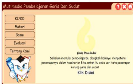
Figure 1. Initial layout of the multimedia

This study has successfully developed a product of instructional multimedia for teaching line and angle to the seventh-grade students of the junior high school. What follows is a brief explanation of the layout in the multimedia developed. at the time the multimedia is run, an initial layout will emerge from the multimedia like what is shown in Figure 1. With the layout of the multimedia as shown in Figure 1, the multimedia has a flexible navigation. The student can see the competencies that he or she has to achieve by selecting SK/KD button. If the student presses the button Klik disini , a page will appear that presents video selection menu for implementing line and angle concepts. For instance, the student selects the application video in the airline, the display is shown in Figure 2.