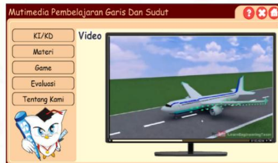
Figure 2 Display of Application Video

In the multimedia, the students can see games, a set of problems, and the developers' profiles, by selecting a button in the multimedia layout. When the student selects student evaluation button, he or she will be directed to two sets of problems, i.e., objective problems that contain problems about the line and angle and problems on materials on the geometrical element. The multimedia presents a game of billiards which has been designed in such a way to accomplish a mission and to win the game, using the concepts of line and angle. The display of the game can be seen in Figure 3.