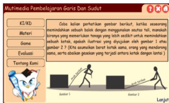
Figure 4. Initial Display of a submaterial