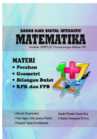
Fig. 1. Front Page of Digital Book

This study developed the interactive digital book for VII-grade deaf students containing 4 learning topics, namely fractions, geometry, integers, LCM, and GCD. The learning media consists of front pages, materials, instructional videos, instructional media, practice questions, and bibliography. The initial display is a front page which can be seen in Figure 1.