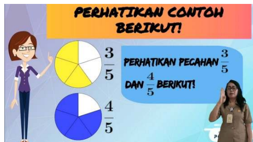
Fig. 3. Display of Learning Videos with Sign Language

Based on Figure 2, material (fractions) is presented using various representations such as real objects in the form of pizza to introduce the concept of fractions, then verbal representations, or stories in the form of conversations between students about fractions, then mathematical symbols of fractions.