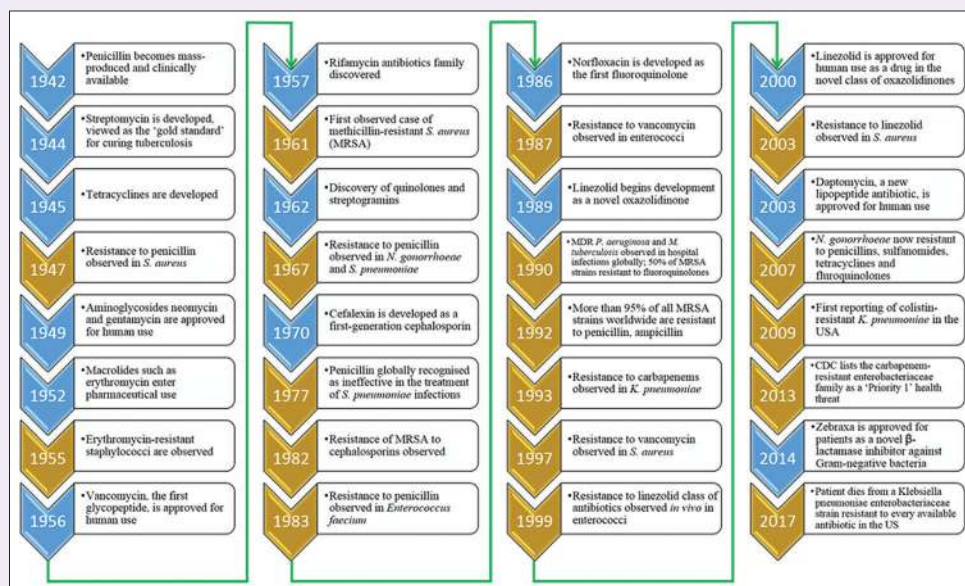
Figure 1: The timeline of antibiotic development and the evolution of resistance. Blue arrows indicate antibiotic discovery and commercialization events, whereas gold arrows represent bacterial resistance to antibiotics observed in patients

discovery. This has directed researchers toward alternative therapies, including traditional plant-based medicines, bacteriophage therapies, and combinational therapies. This review discusses bacterial resistance mechanisms and strategies (both common and novel) in the development of new antibiotic therapies. In so doing, we highlight the use of plant natural products and plant extracts, particularly in synergistic combinations, as having particular promise for rapidly developing new, effective treatment modalities available to combat pathogens resistant to conventional antibiotic therapies.