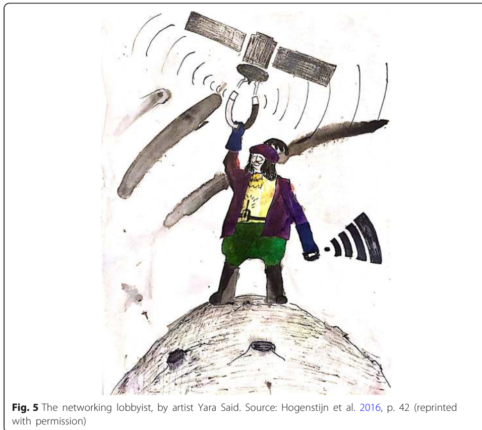
Fig. 5 The networking lobbyist, by artist Yara Said.

government officials. The stereotypes that were developed are therefore based on a limited range of experiences of social entrepreneurs that are active in Amsterdam New-West in the impact area of labour market participation. This small basis implies that research outcomes are not generalizable. We think that a large-scale survey or a randomised sample can yield better results; however, we are also aware that setting up such types of research with entrepreneurs can be a daunting task. We therefore do hope our results can still be a useful starting point for research in other contexts or impact areas.