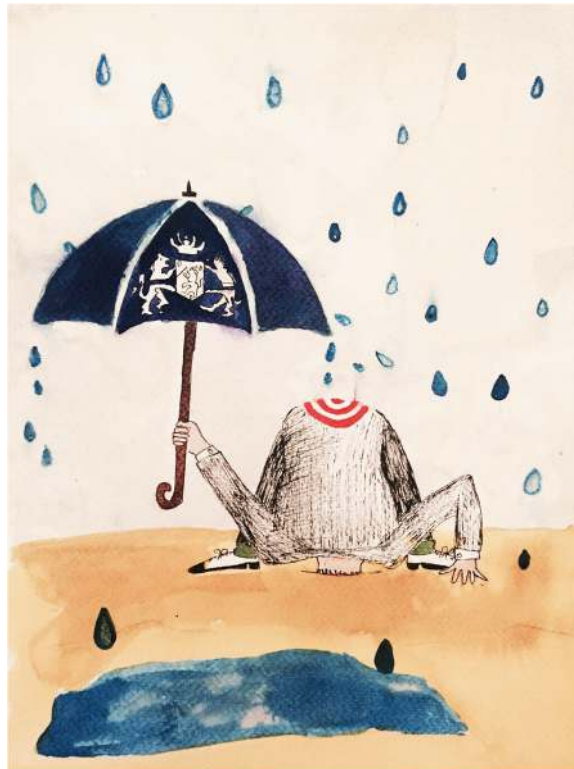
Fig. 1 The disappointed authority avoider, by artist Yara Said.