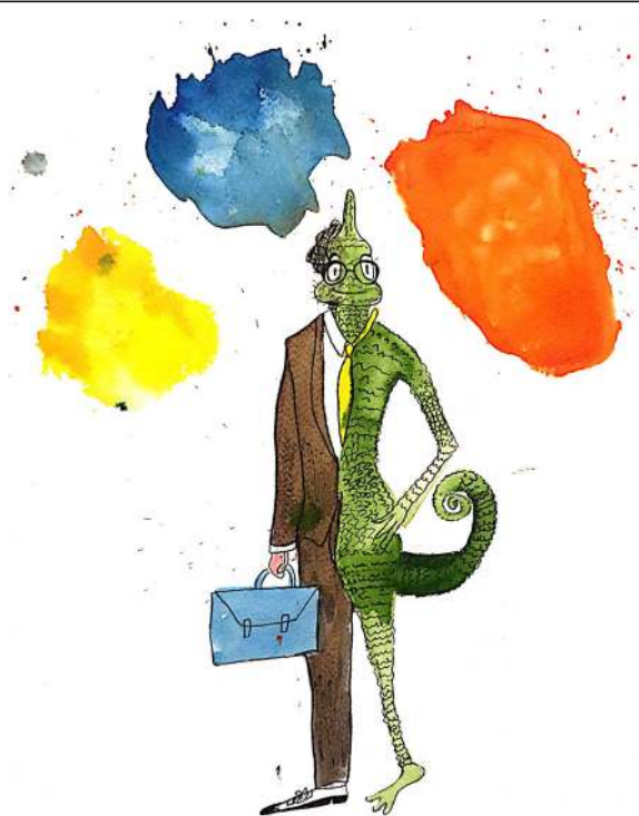
Fig. 2 The creative system changer, by artist Yara Said.