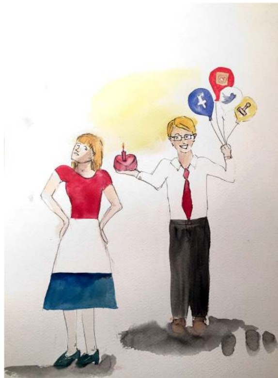
Fig. 4 The strategic policy follower, by artist Yara Said.

The choice to develop stereotypes in this study was not taken in the phase of research design. Instead, it was a choice made at the point where interim results from the learning network were analysed, and the clustering of codes inspired this direction for the development of a practical tool.