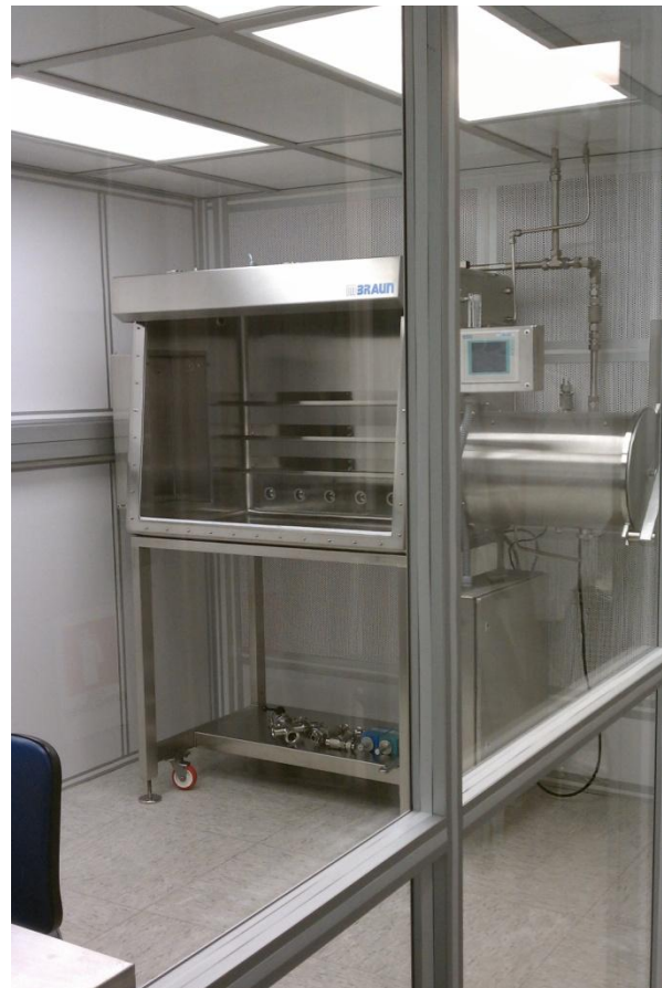
FIGURE 1. The new Hayabusa clean lab and sample cabinet at JSC, after construction has been completed but before readiness clearance. A new glass front for the glove box will be fabricated, and any anodized aluminum parts will be replaced with new stainless steel parts.

Manipulating Sub-mm Asteroid Grains: Although NASA already curates other collections containing sub-mm extraterrestrial particles, these collections include terrestrial materials that significantly aid in their manipulation by sharp glass needles. For example, Cosmic Dust particles and aggregates contain a