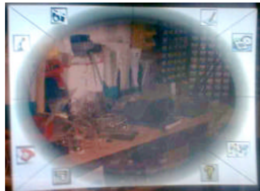
Figure 3: Looking through the glasses

All interaction elements are arranged around the border of the display. The display is separated in nine regions, eight sectors of each 45° and the middle oval. The sectors are used to display information chunks or controls. They are rather small to offer optimal visual acuity for single items in the display. Using this layout the head stabilized information is never blocking the sight of the user. It has also the advantage that if the user is focusing an objects in the real world the border gets out of focus and disappear in the field of vision. The middle region is as, shown in figure 3, transparent and can be used to display word stabilized information. This region should be carefully used not to block vision.