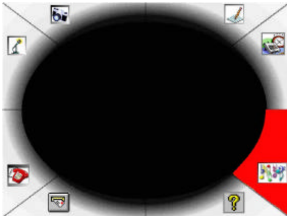
Figure 1: Main screen. Music player selected