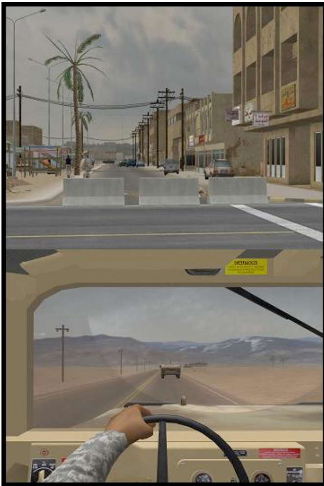
Figure 1. Scenes from Virtual Iraq and Virtual Afghanistan

Users can navigate in both scenarios via the use of a standard game pad controller, although we have recently added the option for a replica M4 weapon with a “thumb-mouse” controller that supports movement during the city foot patrol. This was based on repeated requests from Iraq experienced SMs who provided frank feedback indicating that to walk within such a setting without a weapon in-hand was completely unnatural and distracting! However, there is no option for firing a weapon within the VR scenarios. It is our firm belief that the principles of exposure therapy are incompatible with the cathartic acting out of a revenge fantasy that a responsive weapon might encourage. In addition to the visual stimuli presented in the VR Head-Mounted Display (HMD), directional 3D audio, vibrotactile and olfactory can be delivered into the VR scenarios in real-time by the clinician.