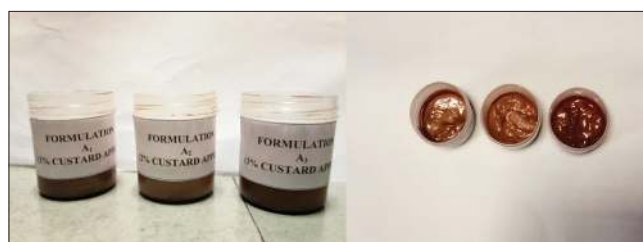
Fig. 2: Formulated anti-aging cream containing custard apple leaf extract