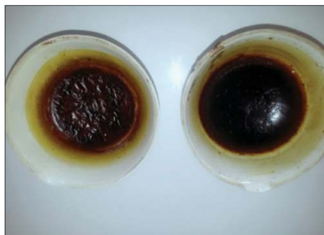
Fig. 1: Herbal extract of custard apple

To determine the washability of a formulation a small amount of cream applied to the skin and wash under tap water with minimal force to remove the cream [32].