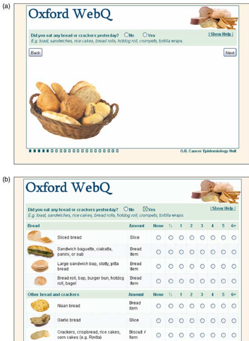
Fig. 1 Screenshots of the compressed (a) and expanded (b) questions on bread and crackers in the Oxford WebQ

in particular to the composite food items. We also added more food items to the choices available.