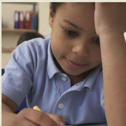
Tests point to higher IQ in breast-fed children.

No one is quite sure what causes this intelligence boost. But one 2007 study by