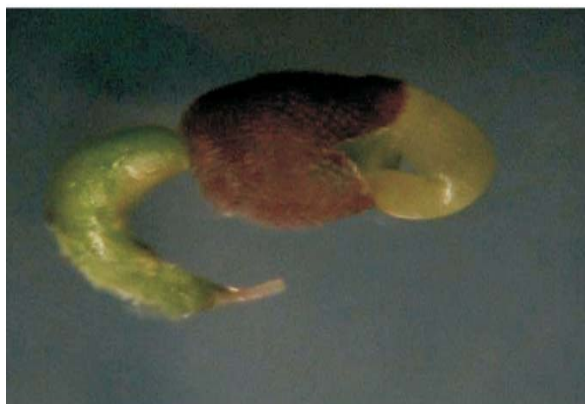
Fig. 3: Germinating hybrid ovules of B. juncea cv. RH30 X B. alba

Developing siliques were excised 10-20 DAP from the field grown plants. After surface sterilization, siliques were dissected aseptically in a laminar hood exposing developing ovules and these were cultured on modified MS media supplemented with different growth regulators. It was observed that maximum ovule germination was from 20 DAP siliques (Fig. 3, 4). Shoot initiation and shoot elongation was observed from ovules cultured on different media. Effective media and appropriate concentration of plant growth regulators were essential to induce ovule