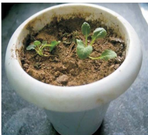
Fig.6: Hybrid plants successfully transferred to soil in the green house

MS medium with IAA (0.5 mg/l), MS medium with IAA (1 mg/l), MS medium + NAA (0.5 mg/l), MS medium + NAA (1 mg/l) and MS half basal. Best rooting was observed on the MS medium containing IAA (0.5 mg/l). Maximum rooting response was observed on MS medium supplemented with IAA (0.5 mg/l) in all hybrids and lowest root response was on medium MS + NAA (1 mg/l) (Table