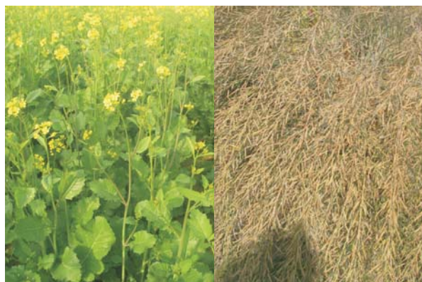
Fig. 7 F 7 progenies grown in the research area