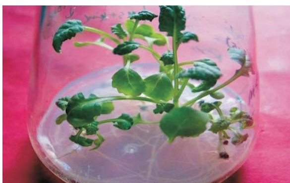
Fig. 4: Rooting in regenerated shoots derived from B. juncea cv. RH30 X B. alba

germination. Effects of basal medium and different concentration of growth regulators on cultured ovules in all crosses are summarized in Table 2. In a cross of cv. RH30 x B. alba , the maximum percent of in vitro embryo germination (79.5 %) was observed on MS medium containing 2.5 mg /l kin and 0.5 mg/l CH. For cv. RH8812 x B. alba , cv. RH0345 x B. alba and cv. RH270 x B. alba , best germination response was 45.6%, 60.2% and 65.7% respectively on MS medium supplemented with 2.5 mg / l BAP and 0.5 mg/l CH. MS basal media containing auxin (IAA) showed poor germination response in all the crosses. But only type of basal medium with different growth regulators did not determine the development of embryos. The effect of DAP was very remarkable for the development of embryos of in vitro cultured ovules. A very low frequency of the ovules germination were found if ovules were cultured at DAP other than 10-20 DAP which indicated that the hybrid ovules excised between 10-20 DAP were more efficient in in vitro culture.