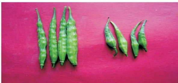
Fig. 2: Siliques of B. juncea cv. RH30 and hybrid siliques of cross cv. RH30 X B. alba

siliques length was 4.1 to 4.5 cm. In crosses between B. juncea cv. RH8812 and B. alba , the hybrid siliques ranged from 2.8 to 3.4 cm in length while in parent plants of cv. RH8812, the siliques length was 4.9 to 5.7 cm. Similarly siliques lengths were smaller for cross RH0345 x B. alba (2.2-3 cm) and RH0345 x B. alba (2.8-3.4 cm) than their recipient parent plants (RH0270: 6.2-7.1 cm; RH0345: 4.5-5.6 cm). Brassica alba siliques length range was observed from 1.9 to 2.2 cm (Table 1). The siliques obtained in all the crosses, at 20 DAP had only 2 to 4 ovules as compared to parents (18-20 ovules) (Fig. 1, 2). These ovules when cultured on different media formed seedlings (Table 2). In all crosses of B. juncea and B. alba , about 39-48% cross success was found (data not shown). In advanced generation ( F_7 ), significant differences were observed in length of siliques and number of ovules. In all crosses, siliques length ranged from 4.7 to 6.0 cm and no. of ovules were 12 to 18.