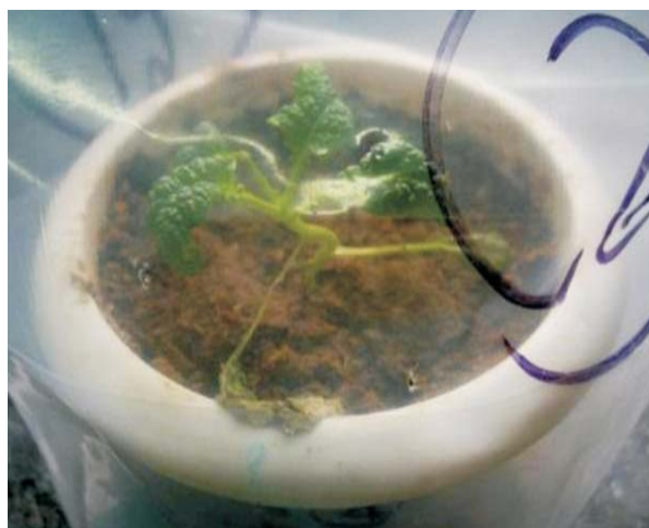
Fig. 5: The regenerated hybrid plants transferred to pots covered with paper bags