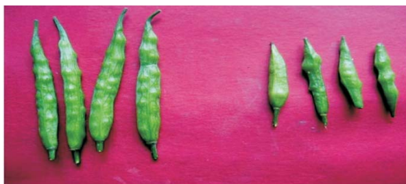
Fig. 1: Siliques of B. juncea cv. RH8812 and hybrid siliques of cross cv. RH8812 X B. alba