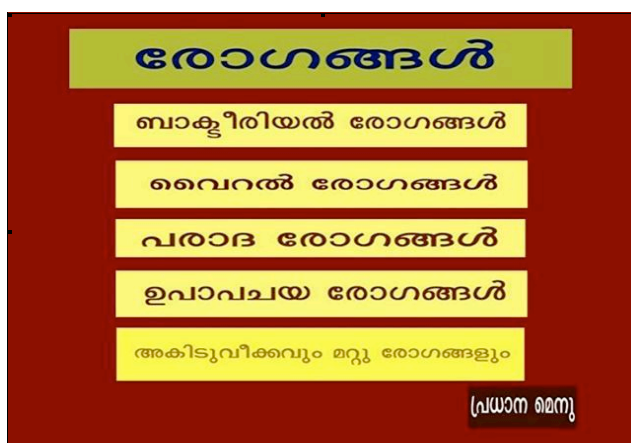
Figure 3: Submenu on “diseases” chapter

The quiz section was essentially designed as a menu page for each of the ten questions with three alternative answers. Selection of one of the answer would lead to a title page where the answer selected was either shown right or wrong as the case may be (Figure 4). The ten questions were linked linearly and on the last question a link to main menu was designed. This quiz section was essentially designed to help the learners of the interactive video - DVD to evaluate themselves.