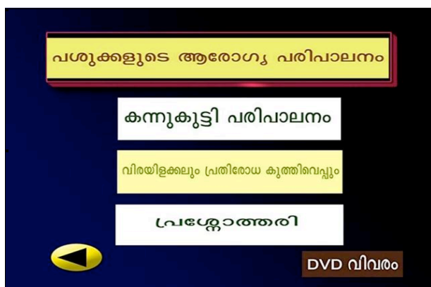
Figure 2: Second page of the main menu