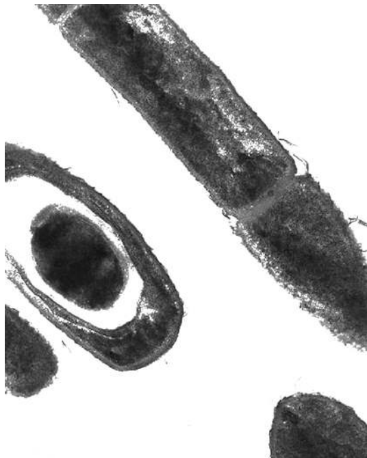
Figure 1 A spore (left) and vegetative cells and a chain of vegetative rod cells of B. anthracis .

administration of anthrax toxin to monkeys, anthrax can be considered a toxin-mediated disease.