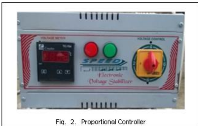
Fig. 2. Proportional Controller

A proportional control is utilized for elimination of cycling by on/off control. The proportional control diminishes a normal power provided to heater as the temperature reaches to the preset point. At preset point, an output on/off proportion is equal; means on and off time is equivalent. If a temperature is additional from the set point, on/off times change with respect to temperature deviation.