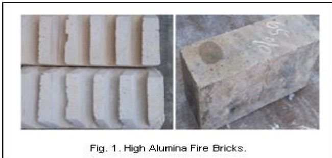
Fig. 1. High Alumina Fire Bricks.