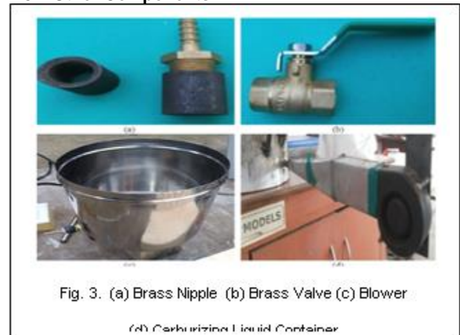
Fig. 3. (a) Brass Nipple (b) Brass Valve (c) Blower