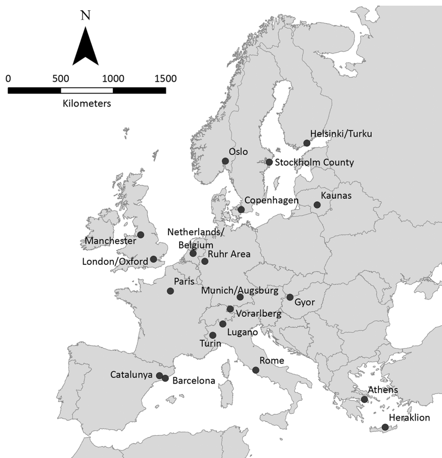
Figure 1. ESCAPE study areas.

standardize GIS analyses and LUR model development. Finalized LUR models were sent to the coordinating center for evaluation.