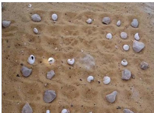
Figure 4. A sand board for (folklore) Seega game