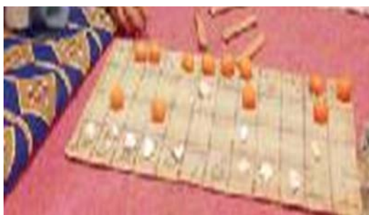
Figure 2. The modern Ta'ab – The Stick Game