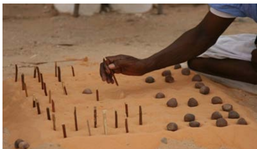
Figure 1. The (folklore) Ta'ab – The Stick Game