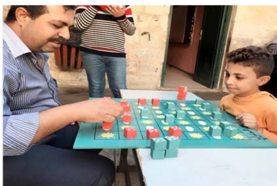
Figure 5. The modern Seega game