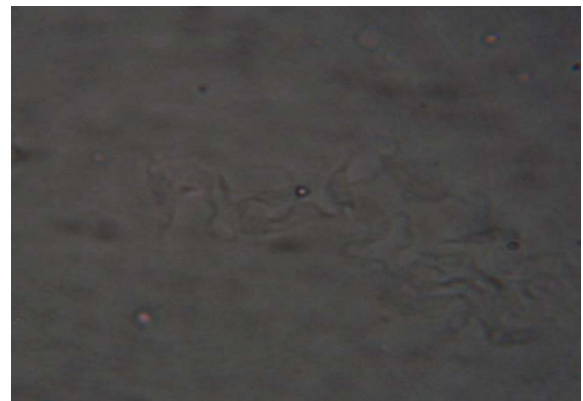
Fig. 2. Negative reaction to SELISA

Another novel application of the test reported in literature pertains to use of the assay as a screening test in hybridoma antibody generation against Babesia bovis (Kungu and Goodger, 1990). These authors reported that the test was 79.94% and 89.47% sensitive in detecting Babesia bovis specific antibodies at 12 and 36 months after the single infection in cattle maintained under tick-free conditions. Although Kungu and Goodger (1990) reported that the test slides can be read microscopically for least a week at room temperature, but in the present study, the test reaction was found to be stable even up to 15 days after the test. Taking into considerations the requirements of the test, repeatability, simplicity, cost effectiveness and its acceptability in the field conditions, SELISA could emerge as a test of choice for the detection of antibodies against T.evansi infection in cattle and buffaloes in developing countries.