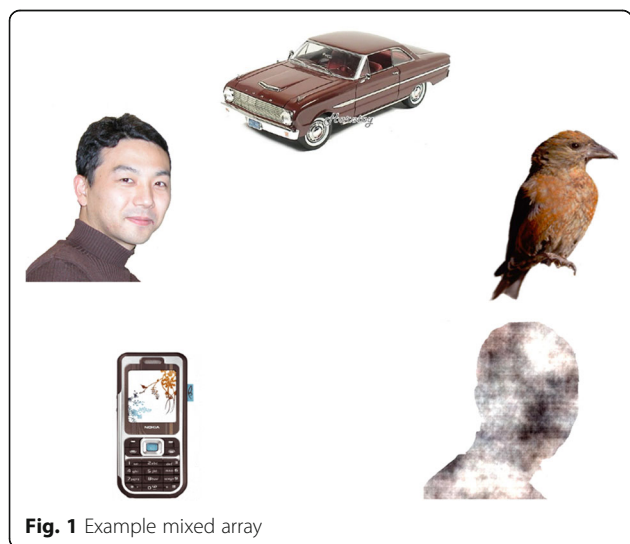
Fig. 1 Example mixed array

The following experimental measures were calculated and are reported in Tables 2 and 3: the total number of first looks to each AOI type as a proportion of all first looks; and peak look duration in each trial, to each AOI type (face, scrambled face and non-social). Peak look duration (i.e. duration of the longest unbroken look to a given AOI) was chosen as the primary metric as it is recommended by Colombo and colleagues as the variable that drives most of the variance in other measures of looking (such as mean look duration and total looking time) and habituation rates during infancy [38], shows robust relationships from infancy to long-term cognitive outcomes [54] and shows good test-retest reliability and consistency across different screen-based tasks amongst 11-month-olds [55]). As children participated in up to 10 trials, peak look durations were averaged across the trials to provide a more stable characterisation of individual differences. For each slide, the peak look in each category (face/scrambled face/non-social) was identified, from a minimum of two looks (> 100 ms). If no peak look was available for a particular category, the trial was