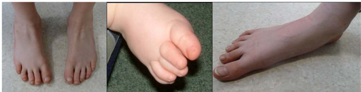
Fig. 3 Minor limb malformations Seen After VPA exposure. Note the hypoplastic and overlapping toes and flattening of the arches due to the joint laxity frequently seen in FVS

at 6 and 18 months [71]. Whilst further evidence is required, currently breastfeeding should be encouraged [72]. A thorough neonatal baby check [67] is essential after birth because of the higher risk of both major and minor malformations. Particular effort should be made to visualise the palate, to check for limb defects, most common involving the radial rays [42–46], to check the spine, and to note any dysmorphic facial features (Listed in Table 4) which are often very recognisable in the neonate. Pronounced ridging of the metopic suture with trigonocephaly [12, 76, 77] may indicate craniosynostosis which will require a referral to a craniofacial team. The risk for malformations of the genitourinary (GU) tract and the heart is increased. Though septal cardiac defects are more common, in some instances very complex congenital heart defects, which may be difficult to detect in neonates, may be present [94] and so one-off scans of the renal tract and the heart should be arranged after birth. Infants exposed to VPA have a significantly increased risk for neural tube defects, most of which will