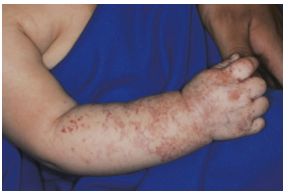
FIGURE 2 Abortive IHs are macular, telangiectatic patches that have failed to fully proliferate.