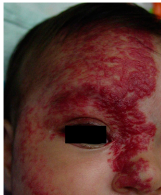
FIGURE 3 Segmental IH of the face.