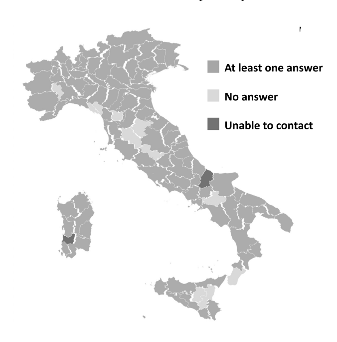
Fig. 1 Italian provinces with at least one unit invited: in grey color those with at least one participant center, in light gray color those without any participating unit. We were not able to invite any unit in two provinces (dark gray color)

In more than three quarter of units (n = 94, 78%), a sterile perineal bag is used to collect urine for culture. In only 16 (13%) and 9 (11%) of the units, either a bladder catheter or a clean catch of urine is chosen, respectively.