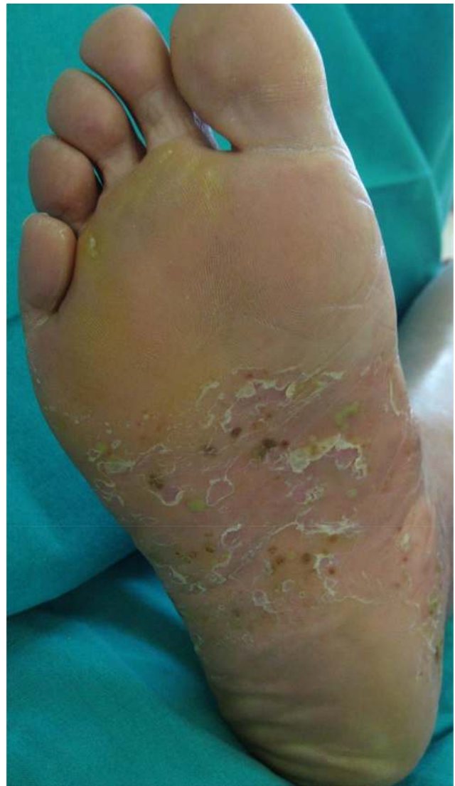
Figure 3 Pustular lesions in a erythematous and scaling plaque affecting the central zone of the plantar surface of the foot.

Studies carried out in patients with generalized pustular psoriasis have found a mutation in IL36RN, and this is considered the most important predisposing factor for generalized pustular psoriasis (GPP). 16 However, the IL36RN mutation was found only in a low proportion of patients with PPP, and no association was found between the IL36RN mutation and PPP. 17 More recently, Twelves et al 17 studied the genetic and clinical characteristics of different forms of pustular psoriasis. Loss of- function mutations in IL36RN were present in 5.1% of patients with PPP. Additionally, it was found that there was a statistically significant association between PPP and IL36RN mutations. Twelves et al 17 also suggested that mutations in IL36RN are related to early onset of the disease in all types of pustular psoriasis and that patients with PPP and age <40 years should do a screen for mutations in IL36RN. 18 Therefore, recent studies indicate the role of the mutation of the IL-36 receptor antagonist gene (IL-36RN) in the development of PPP but also in several forms of psoriasis, namely the plaque type, the pustular palmoplantar type and the generalized pustular type. 19 This finding infers that the interleukin-36 pathway may be implicated in the pathogenesis of this disease. 20 It has