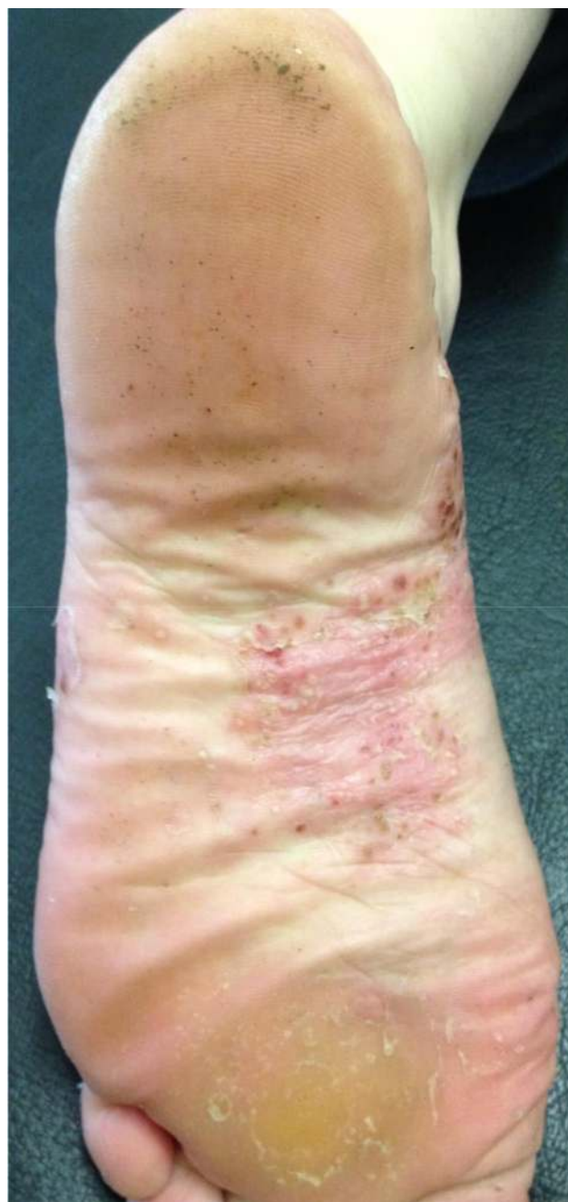
Figure 1 Scattered pustules on a erythematous base with desquamation on the medial zone of the plantar surface of the foot.

Regarding age at onset of disease, disease duration, family history of psoriasis, concomitant arthritis, and cardiovascular disease, no significant differences have been reported between PPP and PPPP in observational studies. 7 On the other hand, female sex, smoking, and autoimmune thyroid disease seem to be associated with PPP. 11,12 In fact, the association with smoking is strong, and it is thought that in individuals with PPP, nicotine is secreted into eccrine glands to promote inflammation and alter the local response to infection. 9 Recent studies have challenged the genetic