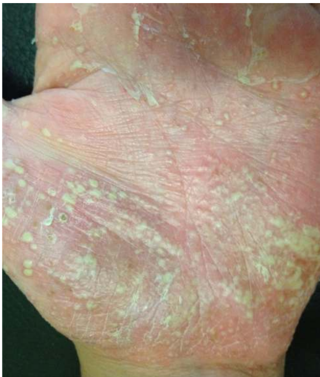
Figure 5 A closer look of Figure 4.

PSORS1 (the most powerful identified genetic risk factor for psoriasis vulgaris) has not been associated with PPP. 13 Genetic studies of TNF-238 and -308 promoter polymorphisms in PPP revealed no connection between polymorphisms and PPP. 23