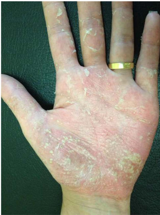
Figure 4 Erythema, multiple pustules and scaling in the palmar surface of the hand.