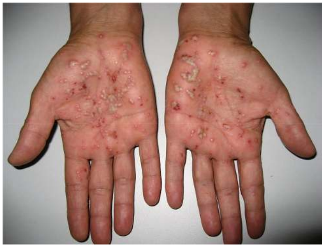
Figure 2 Pustules, sometimes coalescing, with erythematous halo, affecting mainly the palms.

be viewed as an entity independent of psoriasis, mainly due to genetic studies that have not shown an association with the psoriasis susceptibility gene 1 (PSORS 1). 13 Many genetic studies have revealed that PPP may have numerous mutations in the IL36RN, CARD14 and ASPIS3 genes. 14 Future clinical and genetic studies will be crucial to elucidate whether this diverse genetic profile can affect the response to therapy - i.e, biological. 15