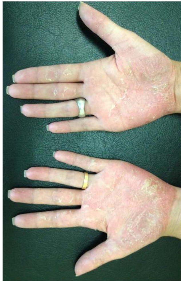
Figure 6 The pustular eruption affecting both palmar surfaces of the hands.