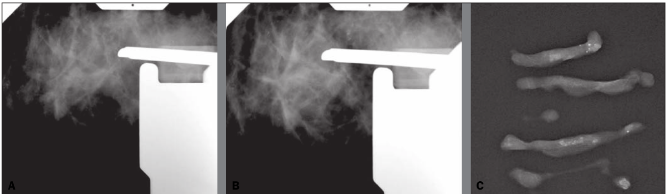
Figure 1. A 57-year-old patient with mammographic finding of amorphous and clustered microcalcifications (BI-RADS 4B). The patient was submitted to core biopsy, whose histological result was DCIS. At surgery, there was diagnostic underestimation (IDC). A: Pre-triggering stereotactic image showing the biopsy needle correctly directed toward the lesion. B: Post-triggering stereotactic image demonstrating the target transfixion by the needle. C: Radiography of the fragments identifying the presence of calcifications.

In the study, among the 11 cases with diagnostic underestimation at subsequent surgery, a variation in lesion dimensions ranging from 0.8 cm to 2.6 cm (mean: 1.4 cm) was observed, and after the post-procedural mammographic images acquisition, a quantitative decrease of 10-50% (mean: