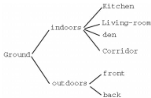
Figure 2: Graph representation of a semantic network example.

where the symbol \subset is represented by \langle . The figure 2 represents the graph conforming the network specified.