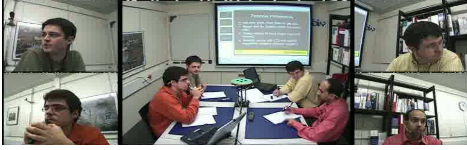
Figure 1: Example of meeting recording environment equipped with microphone array, close caption cameras and overview cameras. A different set of features (acoustic, location or visual features) can be extracted from each of the sensor and used to enhance the diarization process.

the toolkit, section 3 describes the various modules and the processing chain, while section 4 presents recipes, benchmark on the rich transcription datasets and analysis of computational performance.