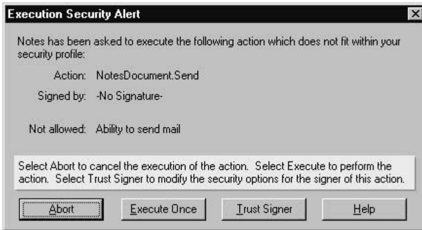
Figure 4: The alert resulting from sending mail from unsigned LotusScript

according to /SoftwareHouse". If they responded with "Execute Once" or "Trust Signer", and if their ECL did not allow unsigned code to send mail on their behalf, the second ESA would appear (Figure 4). Dismissing that dialog in any way finished uncovering the content of the mail message.