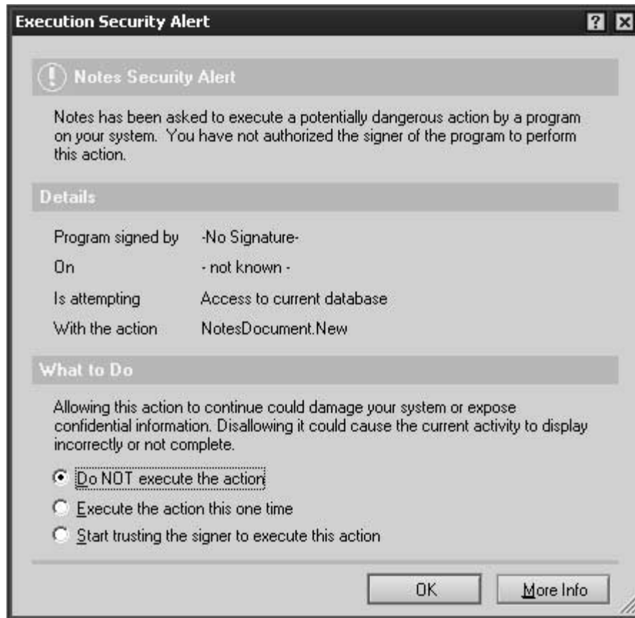
Figure 8: Notes 6 Execution Security Alert

The Notes ECL features we tested can be compared to the features in browsers to control the execution of active content. With version 5.5 of IE and continued in version 6, it is possible to designate active content sources, web sites, into several security zones. There are currently four of those; Internet, Local intranet, Trusted sites, and Restricted Sites. Security for each of these zones can be configured to one of the four templates, called High, Medium, Medium-low, or Low, or it can be customized in detail, starting with one of these templates. IE allows the user to configure whether to disable, enable, or prompt on the downloading of signed and unsigned ActiveX controls, as well as running ActiveX controls and plug in, and scripting ActiveX controls (marked safe or not marked safe). There are no finer grained permissions based on operation within these categories. It also allows the user to configure whether to enable, disable, or prompt when running unsigned or signed Java content, with a fine grained permission list based on Java 2. The Local Intranet zone defaults to Medium-low, which is the same as Medium without prompts. The prompts for code that cannot be signed lack the feature of allowing the user to change the behavior or zone for a site in the context of receiving the prompt (through that dialog). In addition, when a site has