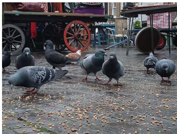
Figure 6. Feral pigeons feeding on volunteer food (Bermondsey Markets, London)

ments) than human, processed foods. The documented high individuality of the birds, their food preferences, as well as the variable nature of accessible food sources results in a high variability of the faecal pH. Once voided, the external factors, such as leaching by rainwater as well as colonisation by bacteria and fungi, change the acidity levels. This too is not uniform but dependent on relative humidity, temperature and available sources of fungal spores.