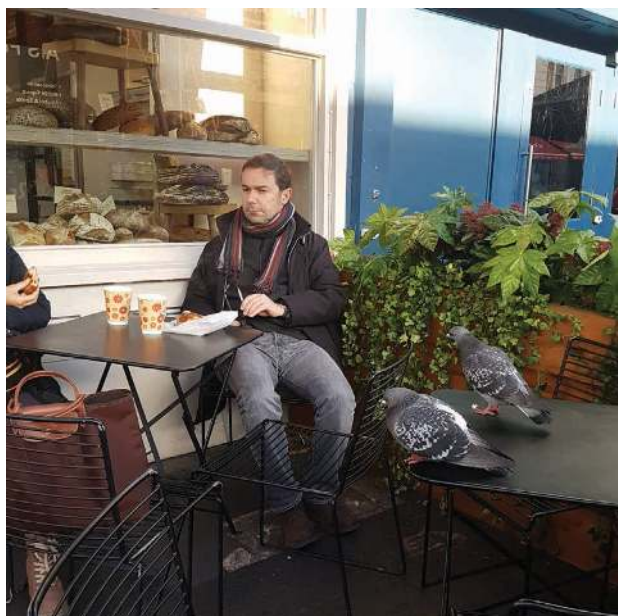
Figure 5. Feral pigeons feeding waiting for spillage of human food (South Kensington, London)