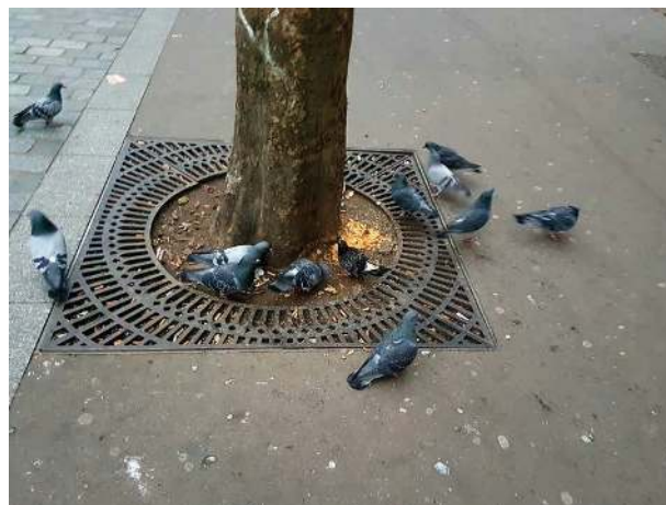
Figure 2. Feral pigeons feeding on discarded human food (Porte de Vanves, 14ème arrondissement, Paris) (Photo Dirk HR Spennemann January 2017)