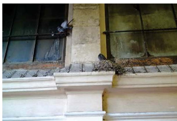
Figure 8. Feral pigeons nesting despite pigeon spikes (Passage Vendôme, 3ème arrondissement, Paris)