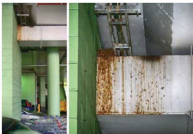
Figure 7. Feral pigeons nesting in the carpark and associated soiling nesting and roosting (Westfield Shopping Centre, Parramatta, NSW)