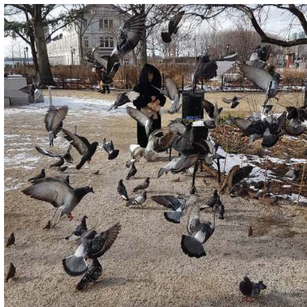
Figure 4. Volunteer food (bread) offered to feral pigeons by a member of the public (Battery Point, New York) (Photo Dirk HR Spennemann January 2017)