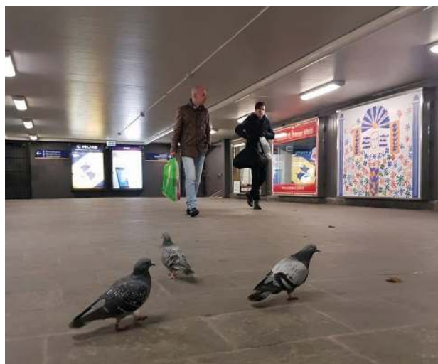
Figure 1. Feral pigeons one level below ground (Tunnelbana Station Centralen, Stockholm)

This paper has reviewed and summarised the current knowledge of various physiological and metabolic factors that influence the acidity of excreta in feral pigeons. Physiological factors that can influence excreta are the bird’s age and sex, and for females, whether they are in the egg-laying stage. While significant, the observed differences are of a smaller magnitude on faecal pH than the influence of diet. Natural, grain and pulse-based foods are less acidic (by an order of 2 pH incre-