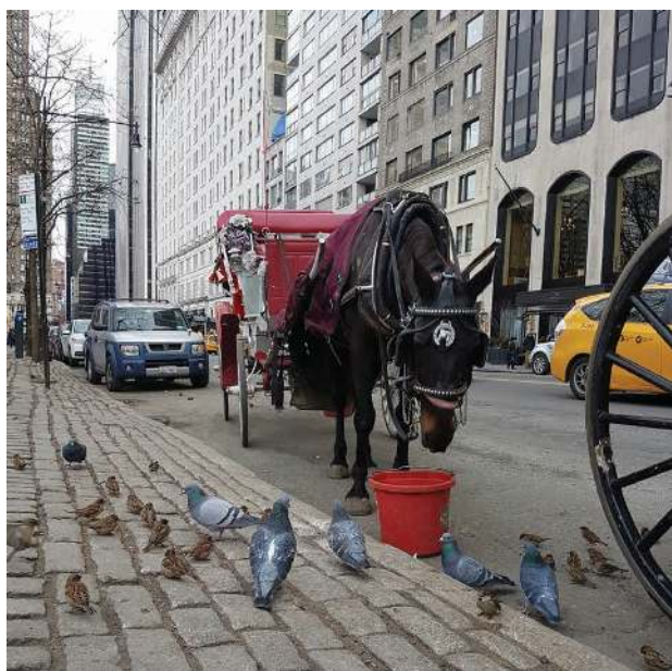
Figure 3. Feral pigeons and domestic sparrows feeding on animal food spillage (Central Park, New York)