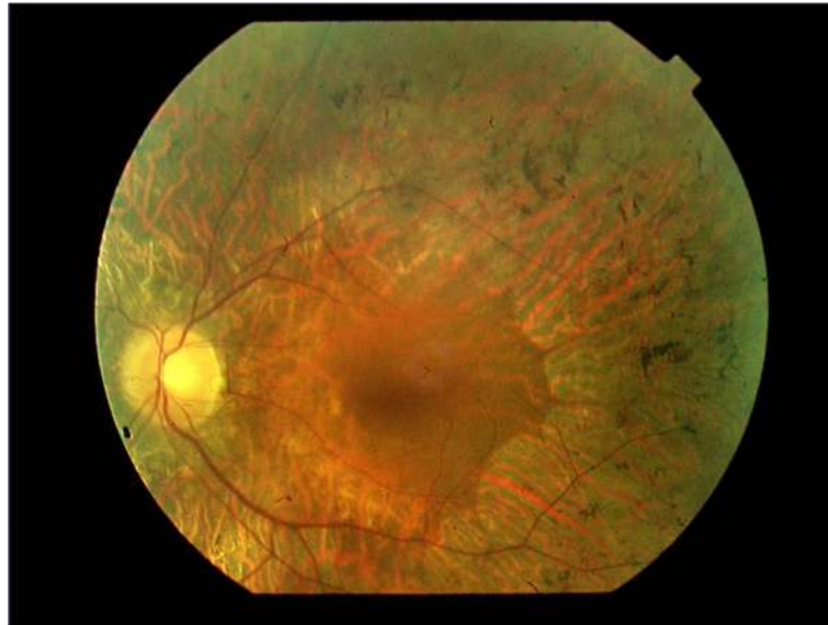
Fig. 2 RP: Pale optic disc, attenuated retinal vessels, midperipheral dystrophy of the retinal pigment epithelium with typical pigmentary changes

3.2 in the left eye for STGD as compared to 5.4 \pm 3.8 in the right eye and 5.1 \pm 3.7 in the left eye for RP patients.