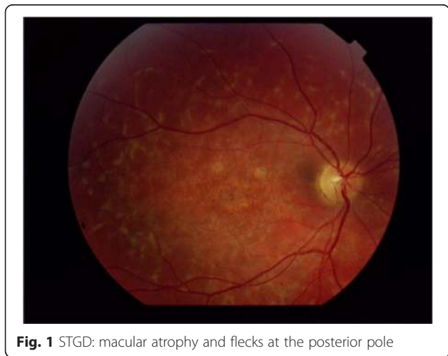
Fig. 1 STGD: macular atrophy and flecks at the posterior pole

At the moment of the dietary analysis Snellen equivalent visual acuity was 3.8 \pm 3.1 in the right eye and 3.8 \pm