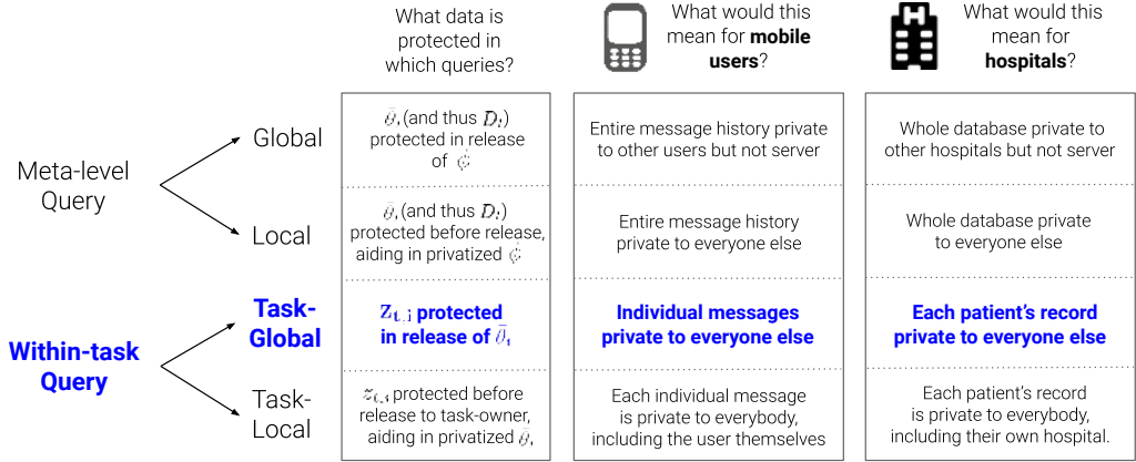
Figure 1: Summary of the privacy protections guaranteed by local and global DP at the different levels of the meta-learning problem (with our notion in blue). On the right, we show what each specification would mean in two practical federated scenarios: mobile users and hospital networks.

of D_t could reveal sensitive information (e.g., a user has sent all messages in a foreign language). In these cases, record-level privacy may not be sufficient. However, given that privacy and utility are often at odds, we often seek the weakest notion of privacy needed in order to best preserve utility.