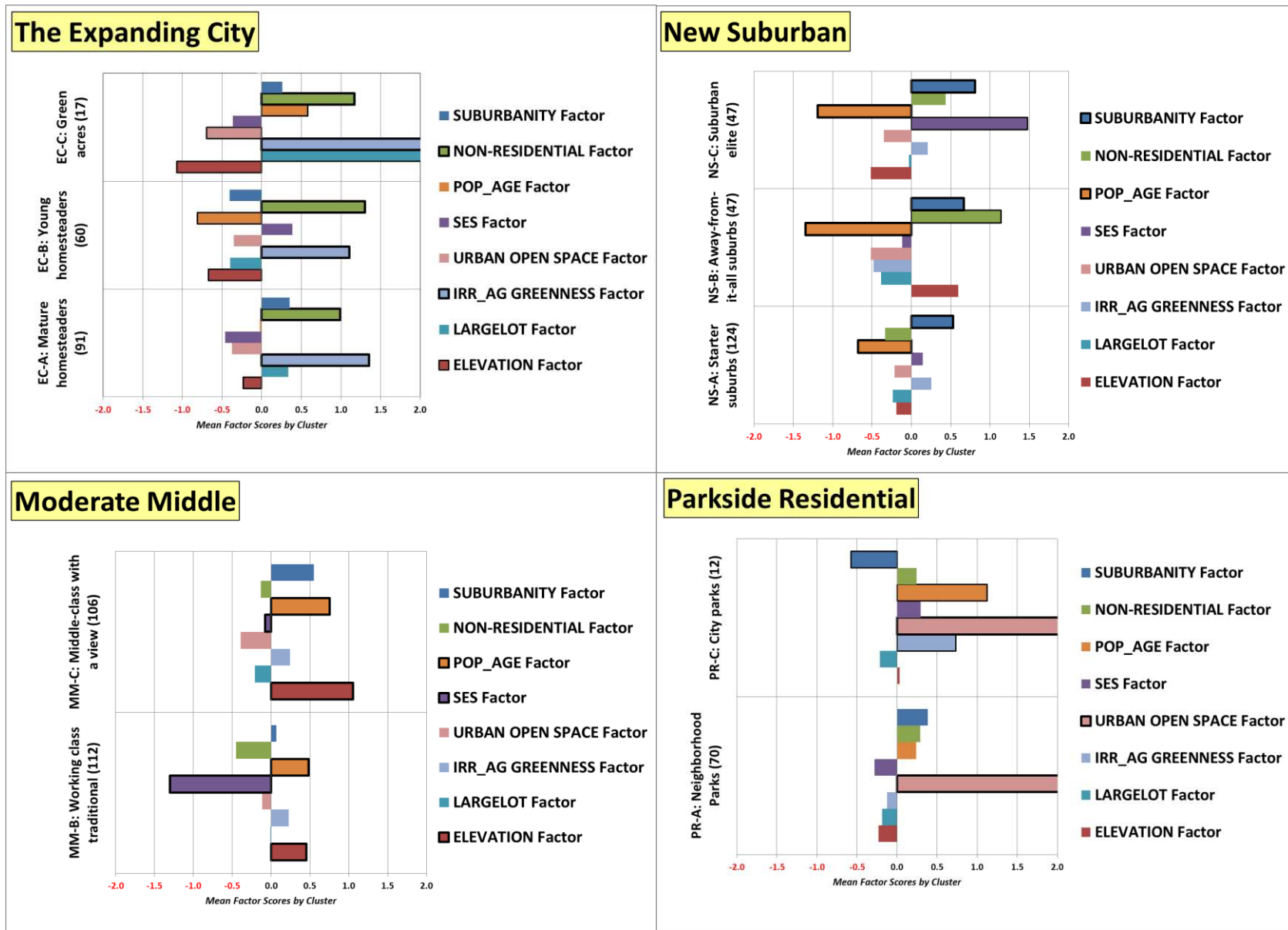
Figure 2a Mean factor scores by cluster groups and neighborhood types.