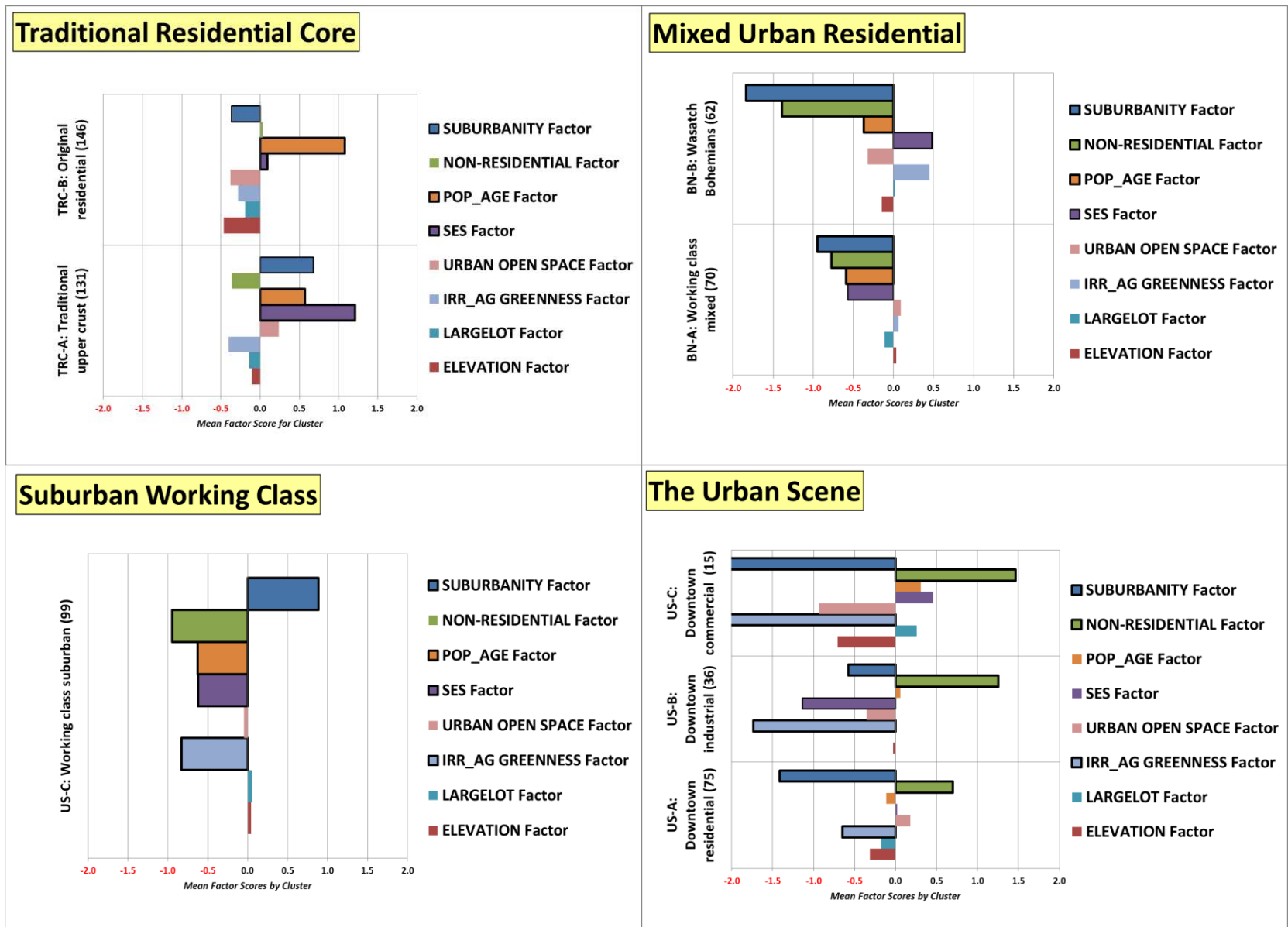
Figure 2b Mean factor scores by cluster groups and neighborhood types (continued).