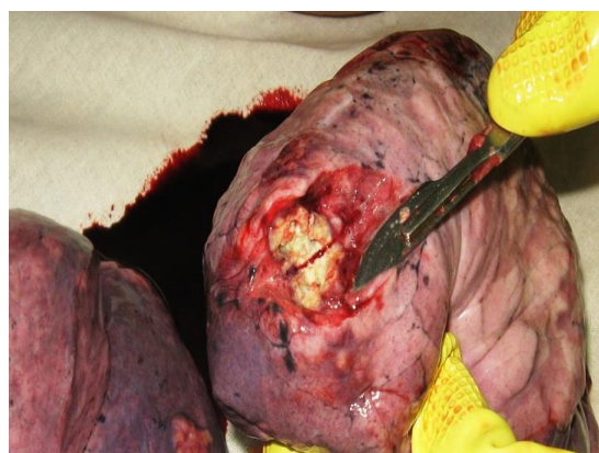
Figure 3: Postmortem specimen of lung parasitic metastases in a 38-year old female patient