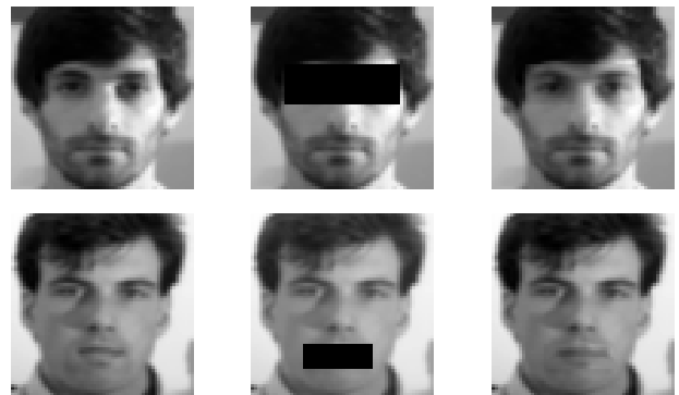
Fig. 3: Reconstruction of two occluded images. Left: Image from the training set for the linear RDN. Center: The observable units corresponding to the visible pixels were clamped, while the observable units corresponding to the occluded pixels were allowed to run free. Right: Reconstructed image shown is the mean of the equilibrium distribution.

the unoccluded observable units to the values o_k , and let the network settle to equilibrium. The equilibrium distribution of the network will then be the posterior distribution p(O_u | O_k = o_k) . Using the linear RDN that was trained on face images, we reconstructed occluded versions of the images in the training set by taking the mean of this posterior distribution. Figure 3 shows the results of reconstructing two occluded face images.