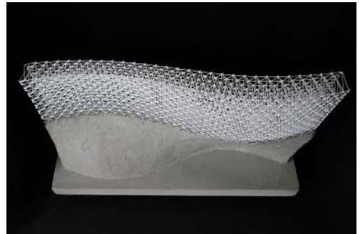
Figure 4 MeshMould research prototype

Indirect intervention / reinforcement / formative and additive. To overcome the complex and manual labour process of creating steel reinforcement cages, the "Tailorcrete" research project has explored the automation of this process through the formative process of robotic bending[4].