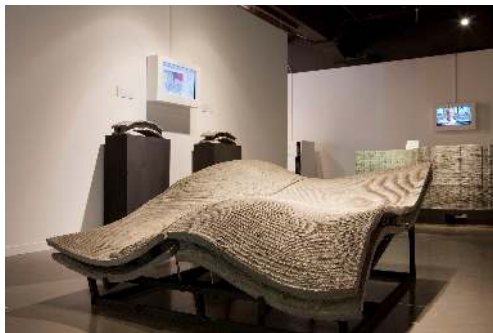
Figure 6 Free Form Construction panel prototype

gates the use of a robot to 3D print the 3D mesh component that serves as reinforcement and guides the creation of the concrete element. With this fabrication system, the design of the 3D mesh can be customized to address variation, for instance, in size, geometry or density. (Hack 2013)