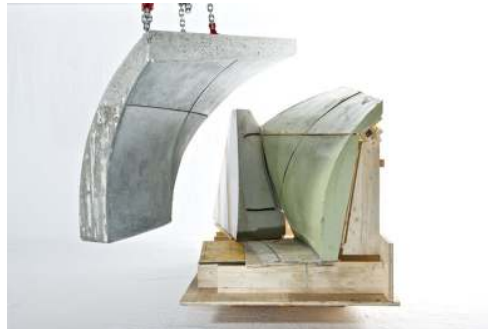
Figure 1 TailorCrete Project - Wax Formwork

Indirect intervention / Rigid Formwork / Subtraction. The fabrication of formwork noticeably continues to be a core issue in research, as it is reflected by most of the examples considered. However, there is an interest in exploring different strategies for its production with the aid of digital fabrication. To surpass the limitations of using standard EPS milled formwork, the TailorCrete project (Gramazio and Kohler 2011) [1] recently developed a wax-based formwork for complex geometries with the aid of robotic pin actuators (Figure 1). This strategy showed comparable efficiency to EPS systems but performed better in terms of the economy and ecology of the process, and of the surface finishing qualities of the fabricated pieces. At the same time, a greater level of geometrical freedom and texture expressions were made possible with EPS formwork by the adoption of 6 and 7-axis robotic arms instead of the standard 3-axis CNC routers commonly used for milling [4].