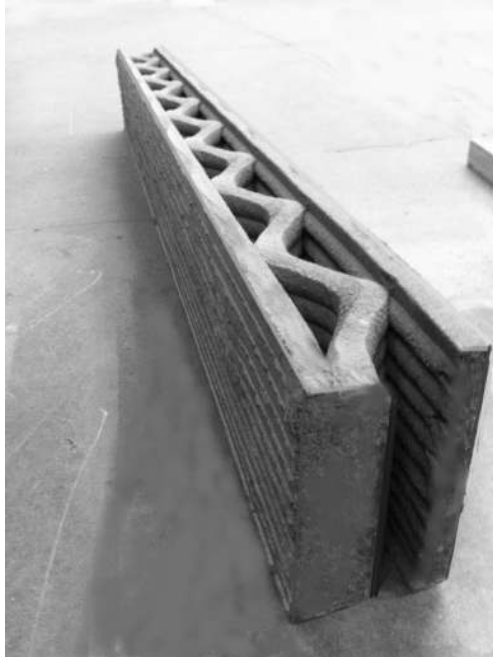
Figure 5 Contour Crafting wall prototype