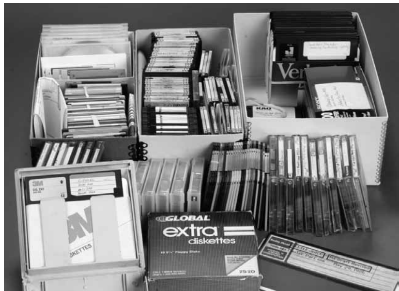
Fig. 1.1: An assortment of disks from the Ransom Center's collection.

While such activities may seem happily removed from the concerns of the cultural heritage sector, the methods and tools developed by forensics experts represent a novel approach to key issues and challenges in the archives and curatorial community. Libraries, special collections, and other collecting institutions increasingly receive computer storage media (and sometimes entire computers) as part of their acquisition of “papers” from contemporary artists, writers, musicians, government officials, politicians, scholars, scientists,