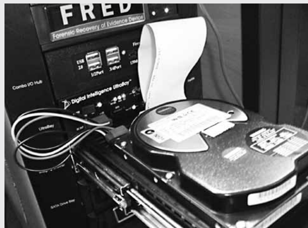
A hard disk is imaged using one of BEAM's "capture" workstations.

Next, we use forensic hardware and software tools to create a disk image of each item. The process varies slightly according to the type of medium, but in each case we use a write-blocking device to ensure that no data are written back to the source disk. The image below shows a hard disk being imaged.