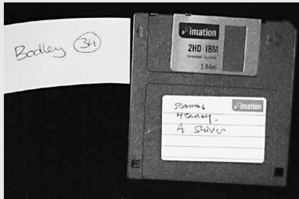
3.5-inch disk submitted to the Clutag Press by Seamus Heaney.

photograph disks to create a visual record of annotations for future catalogers and researchers.