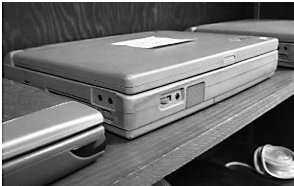
Fig. 2.1: Laptops in the Ransom Center’s collection.