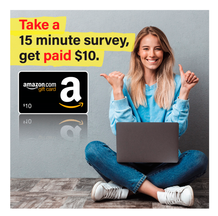
Figure 4. Facebook study recruitment ad.

The development of methods for experimentation within social media platforms is essential for the progress of public health media campaign research, especially in the context of tobacco control. This study demonstrated a new platform that allows for customized recruitment and longitudinal follow-up of participants, as well as the execution of survey research within Facebook, which was found to be feasible for media campaign awareness studies [14].