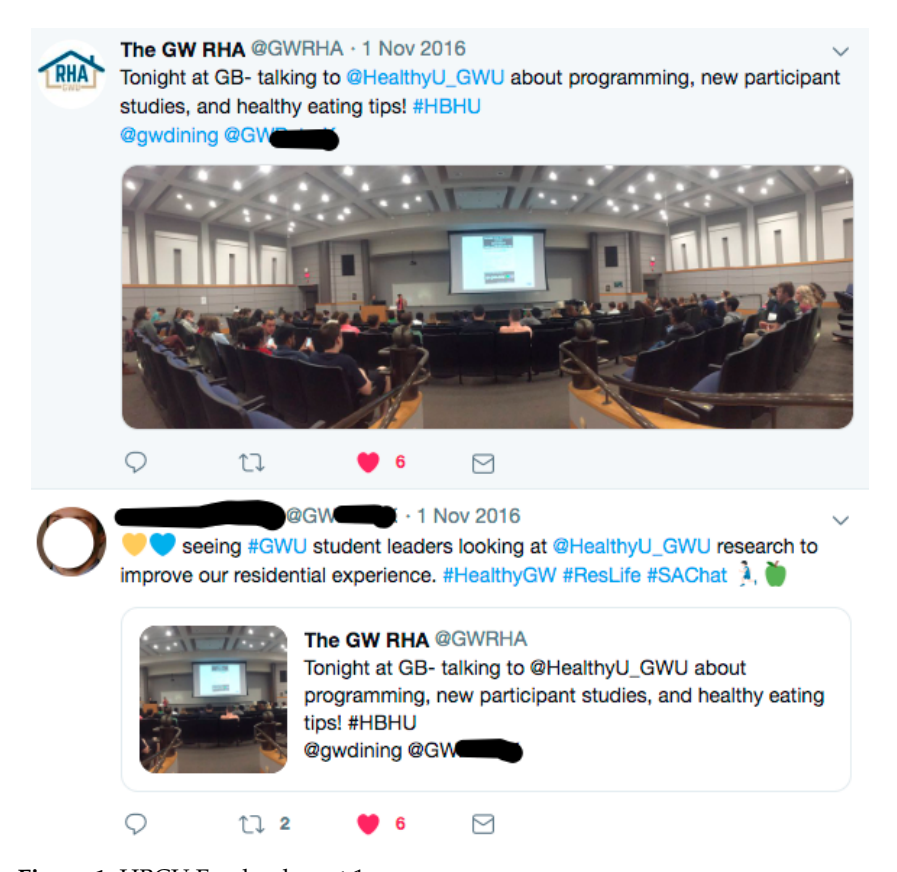
Figure 1. HBCU Facebook post 1.

There were different channels for recruitment using social marketing principles [30], such as placement of materials in high-trafficked areas and standardized branding using study-specific colors, logos, and fonts. Furthermore, technology was used as a specific outreach strategy. The following figures illustrate how these elements of the program were implemented. "Micro targeting" or delivering advertisements through Facebook targeting specific demographics, was used (see Figure 1). Key leaders on campus, such as academic deans, also tweeted or retweeted study-related recruitment efforts (see Figure 2).