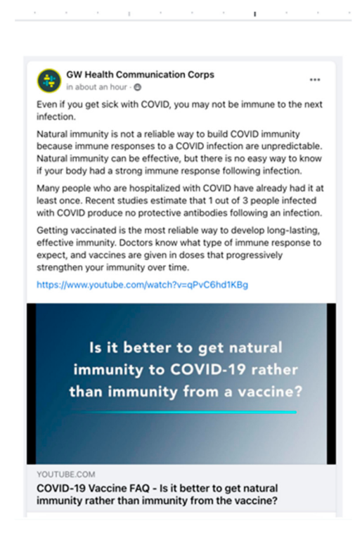
Figure 3. Sample post.

likes. We used this Facebook page to run recruitment ads in August 2021. The recruitment ads were served to our target audience which included men and women 18–24 years of age who are located in the United States. After recruiting participants, we created another Facebook page called "Consumer Consciousness". This page was used to run the target ads on the recruited participants' Facebook newsfeeds during the study time period. We created this second Facebook page, with a different name, to control for any bias. Although we created two different Facebook Pages, they were both under the same Facebook Business Account, "Digital Health Research".