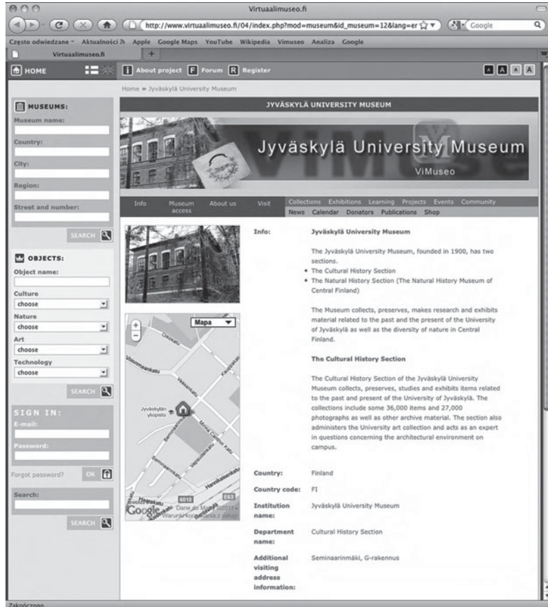
Fig. 1. Screenshot presenting the Jyväskylä University Museum (Version A).

the Finnish museums in one service ( http://www.museot.fi ). The list, which is incomplete, includes around 900 museums. This long list includes links to the museums' own websites or to the web pages belonging to municipalities' own websites. In 2008 and 2009, I conducted a preliminary study of these museums' websites. The number of museums has been constantly changing, but the results are comparable. Most of the museums' websites or web pages are not professionally prepared and