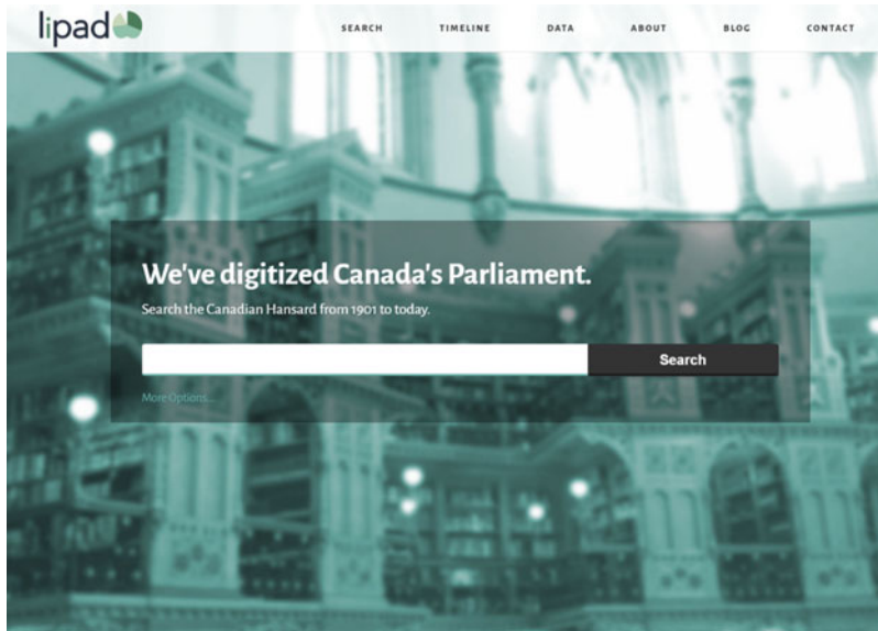
FIGURE 3 Lipad.ca Home Page