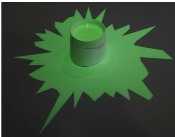
Figure 4. Digital seasoning from Huisman et al. (2016). Colour, shape, and sound are all used to prime notions of sourness, and by so doing modify people's perception of the sourness of the yoghurt that they are tasting. [Figure reprinted from Huisman et al. (2016) with permission.]

Heylen, 2016). These researchers also found that they could digitally season the foods that people were tasting. The projection shown in Figure 4 (together with the accompanying sound) brought out the sourness in a sample of yoghurt that they have been given to taste (see also Crisinel, Cosser, King, Jones, Petrie, & Spence, 2012; Reinoso Carvalho, Van Ee, Rychtarikova, Touhafi, Steenhaut, Persoone, et al., 2015, on the notion of digital sonic seasoning; and Sakurai, Narumi, Ban, Tanikawa, & Hirose, 2013, 2015, on the enhancement of tasting experiences by means of projection mapping).