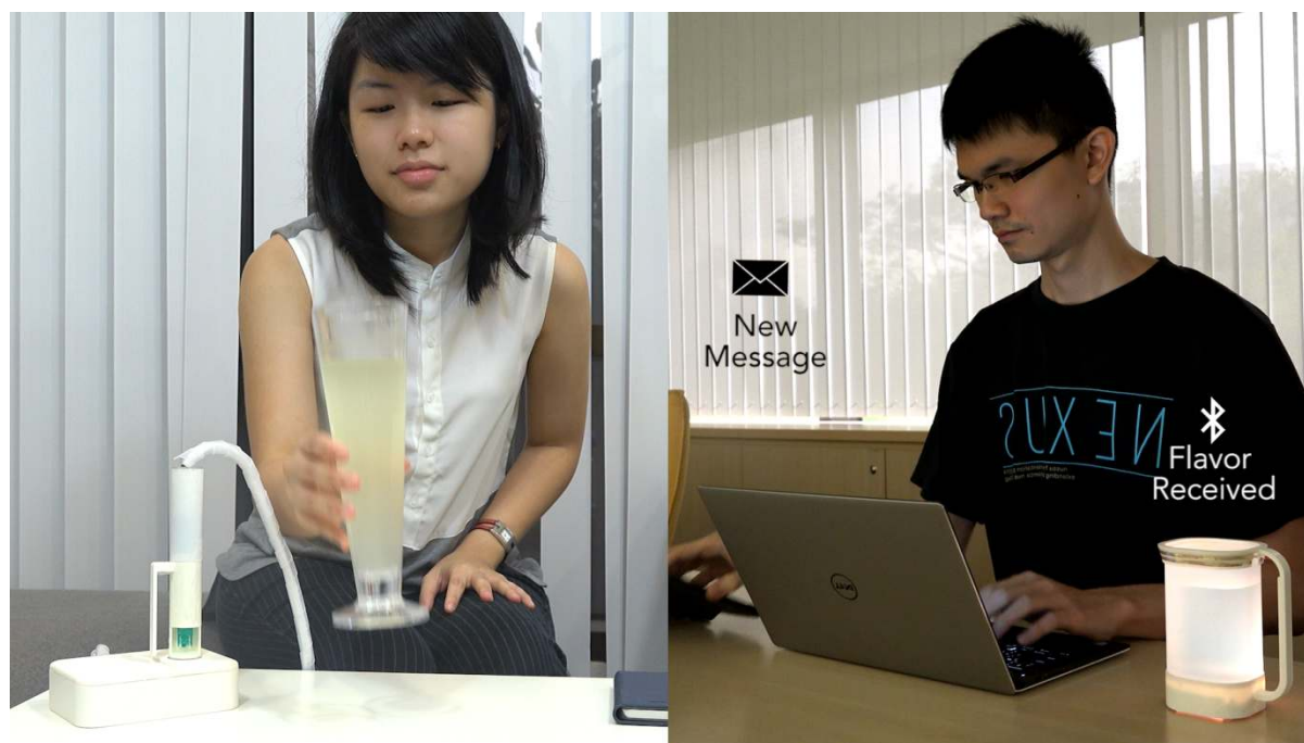
Figure 3. In the future, will we be able to send others some virtual lemonade? Still image from Ranasinghe et al. (2017). Reprinted with permission.

digitization of the latter that is likely going to provide a much richer range of sensory input. In fact, it is striking to note how little of a loss of flavour sensation many people report when they have lost taste sensation (see Brillat-Savarin, 1835; Pfaffmann & Bartoshuk, 1990; though see also NPR, 2011). By contrast, we are all familiar with how food doesn't seem to taste of anything much whenever we have a cold that blocks our nose (see also O'Hare, 2005). It is important to bear such figures in mind when thinking about recent augmentation devices that some have been tempted to claim can transmit lemonade over the internet (see Lant & Norman, 2017; Ranasinghe, Jain, Karwita, & Do, 2017). Note that while this is an ingenious solution, 14 transmitting both a sour sensation electrically (via two electric strips on the rim of the tumbler), together with the appropriate colour (green, yellow, or cloudy in this case) via an LED embedded in the tumbler in which the drink is served (see Figure 3 ), no attempt was made to simulate, or actually deliver, the aroma of lemon. Change the colour of the light shining into the glass (to brown, say) and you could as well be transmitting malt vinegar instead. What differentiates these sour-tasting liquids, then, is largely the aroma (see Spence, 2015a). Without the delivery of the latter, the experience is likely to resemble drinking sour water more than anything else.