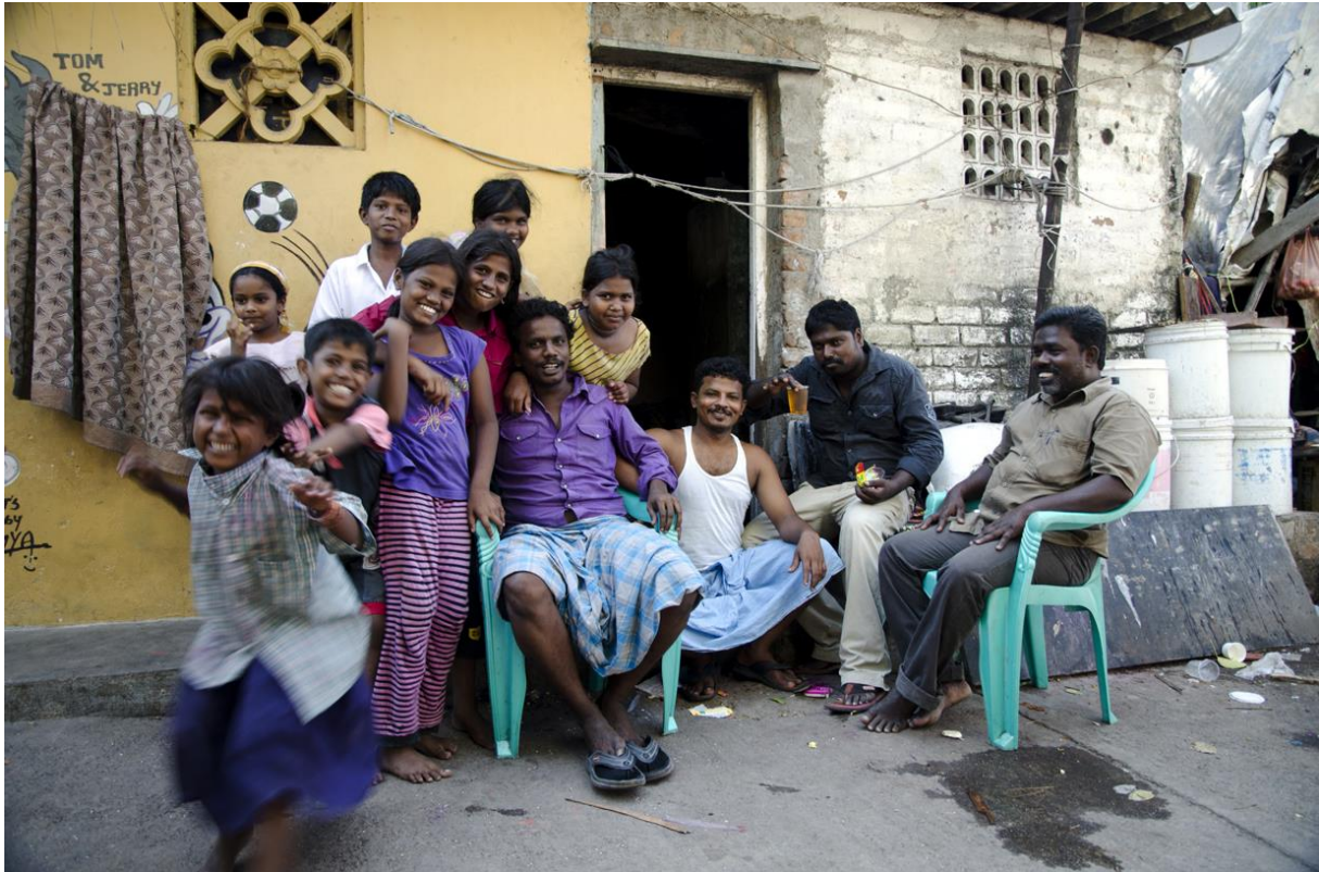
Figure 2. Family Gathering