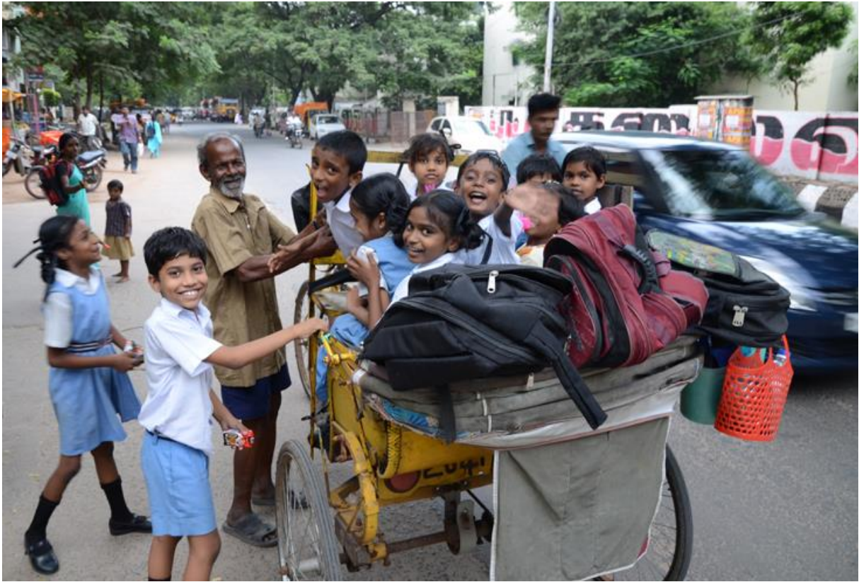
Figure 1. Chariots of Youth