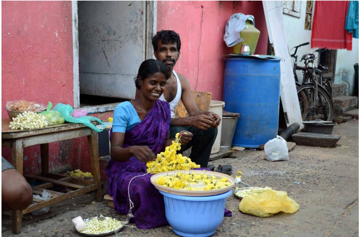
Figure 3. Trades People