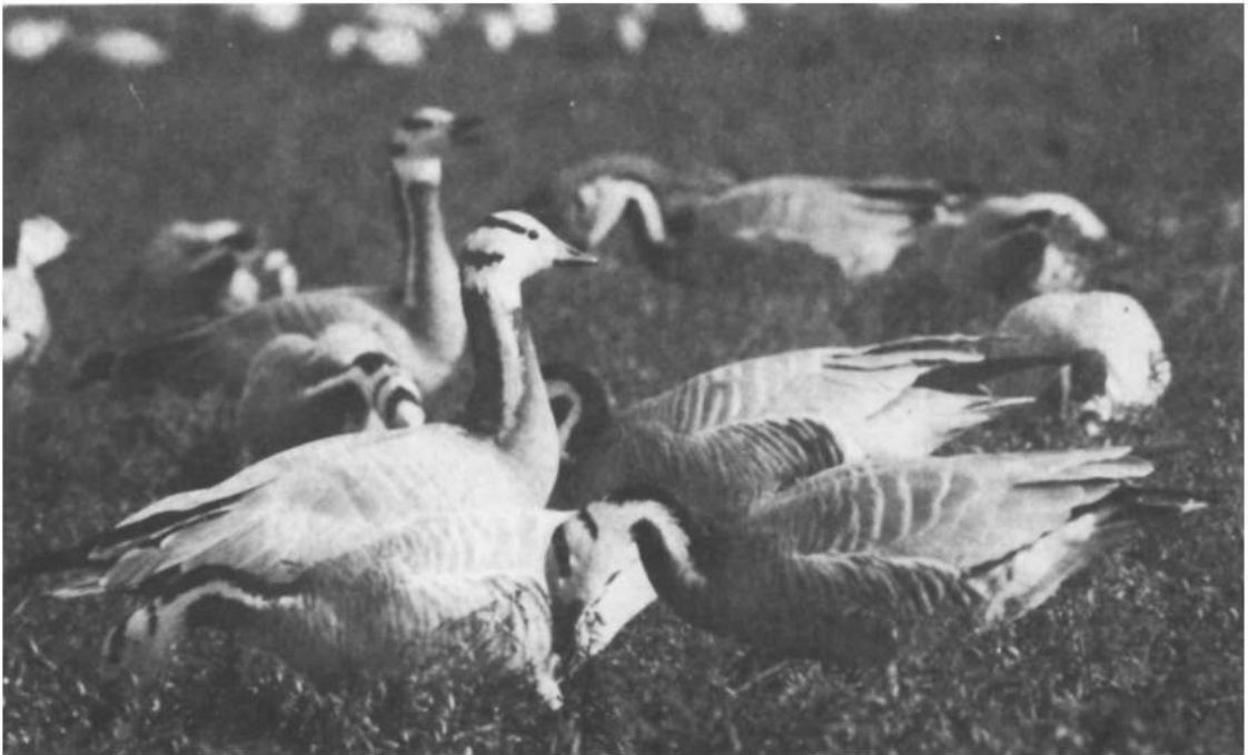
Bar-headed geese grazing in a field of bengal gram (Asad R. Rahmani).

breeding. Apart from the lack of trees there seems little to prevent these birds nesting. At Bar-sori Tank (Figure 1) there is already a small breeding colony of openbill storks in four acacia trees. In 1986 nearly 50 chicks were raised in this colony and a few nests of darter and little cormorant were recorded.