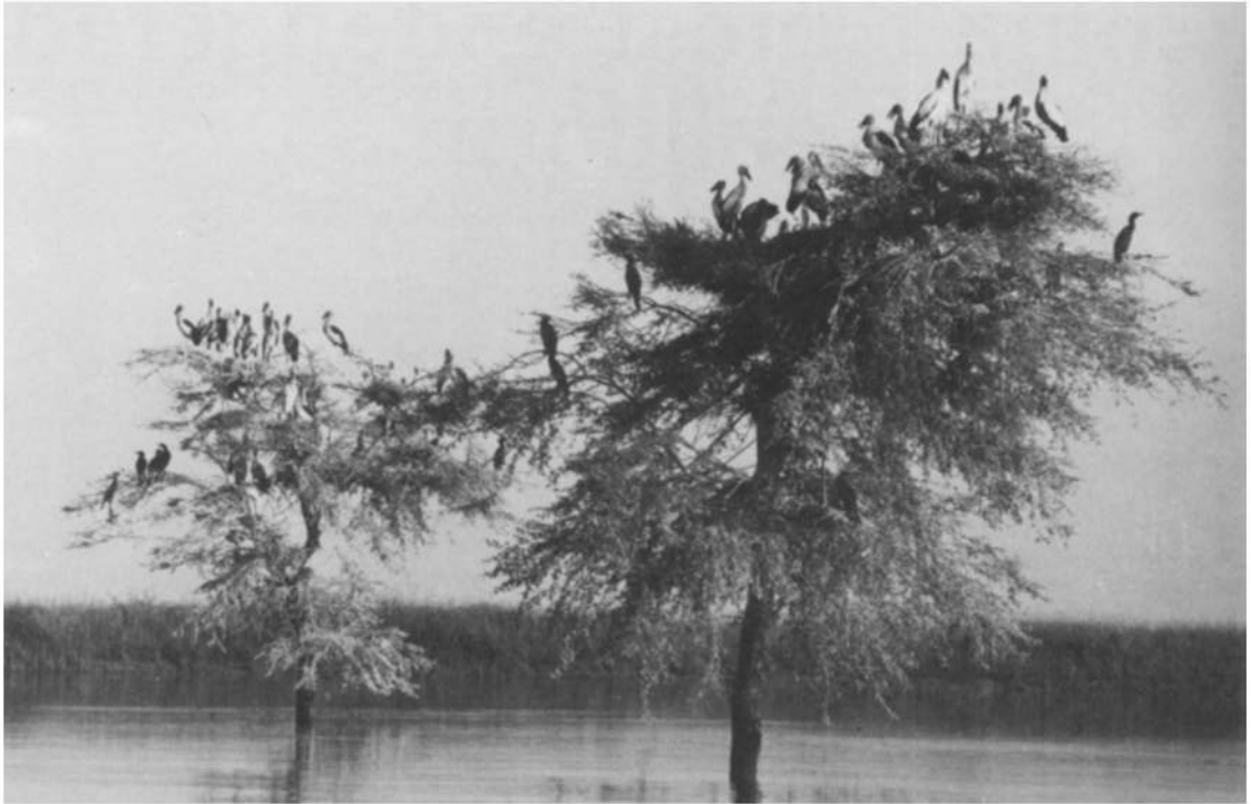
The colony of open-billed storks at Barsori Tank in Karera Bustard Sanctuary.