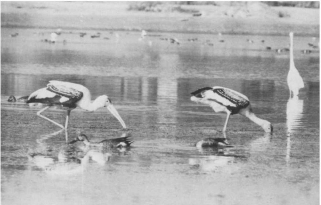
Painted storks feeding in Dihaila Jheel.

The Central Indian Government has agreed to all