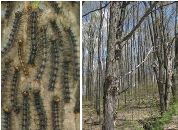
Fig. 1 Wide scale defoliation by gypsy moth triggers short term changes in light, temperature, and moisture regimes on the forest floor, alters nutrient cycles, and exerts longer term effects on competitive interactions and successional trajectories