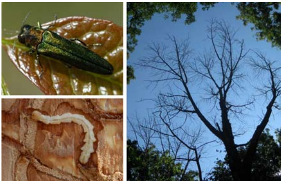
Fig. 2 Ash mortality induced by emerald ash borer results in isolated but widely distributed canopy gaps, coupled with extirpation of ash species from invaded forests

interactions that reverberate throughout the forest ecosystem.