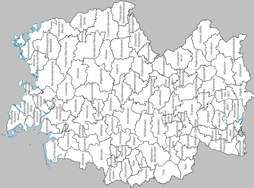
Figure 1 Raumordnungsregionen in Germany