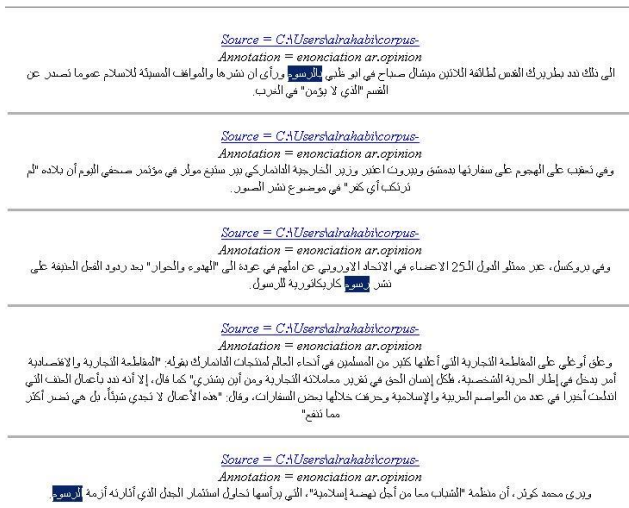
Figure 3: screenshot of the results of the annotation

The process pipeline starts with segmentation and the annotation process is then called, the results are directly displayed in a base of annotated segments, according to their classification in the semantic map. The user can then navigate between the base and the original sources, or carry out a search by keywords on various spaces defined by the segmentation or by the places of the markers in segments, i.e. the content of quotation, the place of speaker, the theme of quotation... In figure 3, the base of annotations contains quotations annotated in Arabic, the user filters only those having the annotation of "opinion" of speaker, on which he carries out a request with the keyword "رسوم" / drawings).