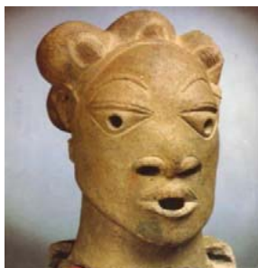
Fig 2. One of the Nok Culture Clay Products

It is the same subterranean longevity that enabled the archaeological investigations to access clay products in northern Nigerian, globally known as Nok terracotta pieces. These were between 500 BC and 200 AD. The resilience of these pottery products sustained even the delicate features of the images.