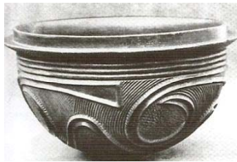
Fig. 1. Oku..The hemispherical vessel from Inyi with all-over Uli decorations

Thurstan Shaw gives credence to the above fact. The circles and concentricity represent generational continuity and long life. These elements can also be seen on the hemispherical pot locally referred to as 'Oku'