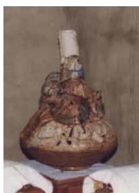
Fig. 7. "Ogoni Nine", (1994), 24"x18". Copyright: Umunna

The voiceless images of pottery (clay) suddenly become vocally empowered by the reconfiguration and manipulation of the artist's hand.