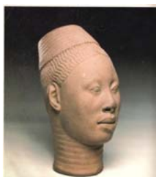
Fig. 3. One of the Ife Terracotta Heads

The Ife terracotta heads of between 12 th and 15 th centuries fall into the same antiquity mould facilitated by the same fired clay (terracotta) resilience and longevity capacity. These were found in 1953 by Bernard Fagg under the shrine of the goddess of riches known as Olukun. These are on display at the Federal Department Of Antiquity, Lagos, Nigeria.