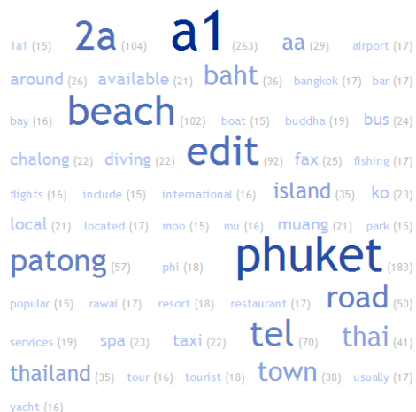
Figure 2. An example of tag cloud on Wikitravel-Phuket

Document Type View is another form of visualization. A similar idea has been demonstrated as a tool on the Ainibot Website 4 . DTV provides a representative overview structure of a Web page in the form of a tree structure as shown in Figure 3.