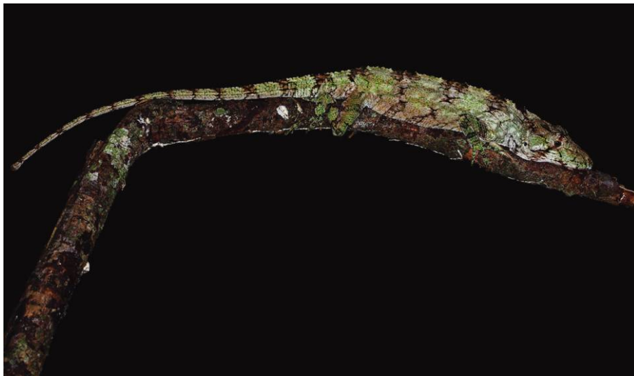
Anolis landestoyi perched on a branch.