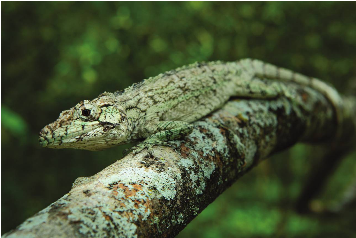
Figure 1: Anolis landestoyi sp. nov. (DLM_DR2011_11), posed in natural habitat.

online). Distinguishable from similar anoles in the Cuban chamaeleonides clade by dewlap color and pattern; absence of a large, rugose parietal casque in adults; presence of nuchal ocellus; presence of a single scale between nasal and rostral, flank scales in partial contact; weakly to strongly keeled ventrals; and multicarinate supradigitals (table S3). Additional diagnostic information is provided in section S1(c) of the appendix and table S3.