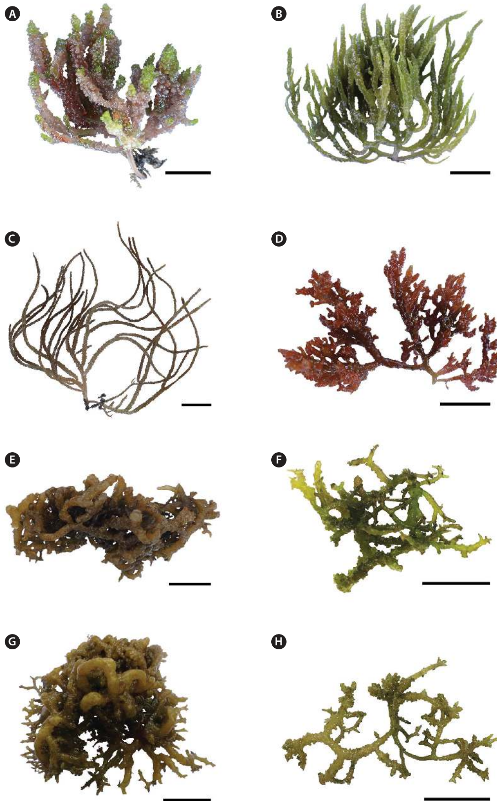
Fig. 2. Representative specimens of wild Kappaphycus used in this study. K. alvarezii specimens from Guiuan, Eastern Samar: (A) SamW-004, (B) SamW-023, (C) SamW-034, and (D) SamW-013. K. striatus specimens from Bolinao, Pangasinan: (E) MAL7, (F) SIL17, (G) MAL27, and (H) MAL19. Scale bars represent: 5 cm.