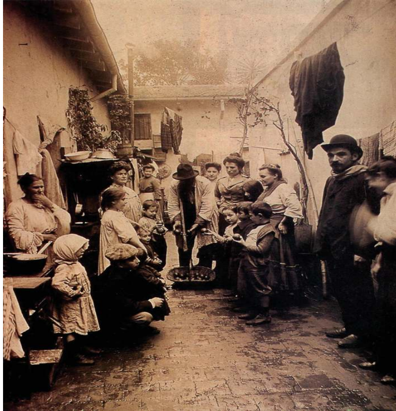
Interior Patio of a Conventillo in Buenos Aires, Early Twentieth Century