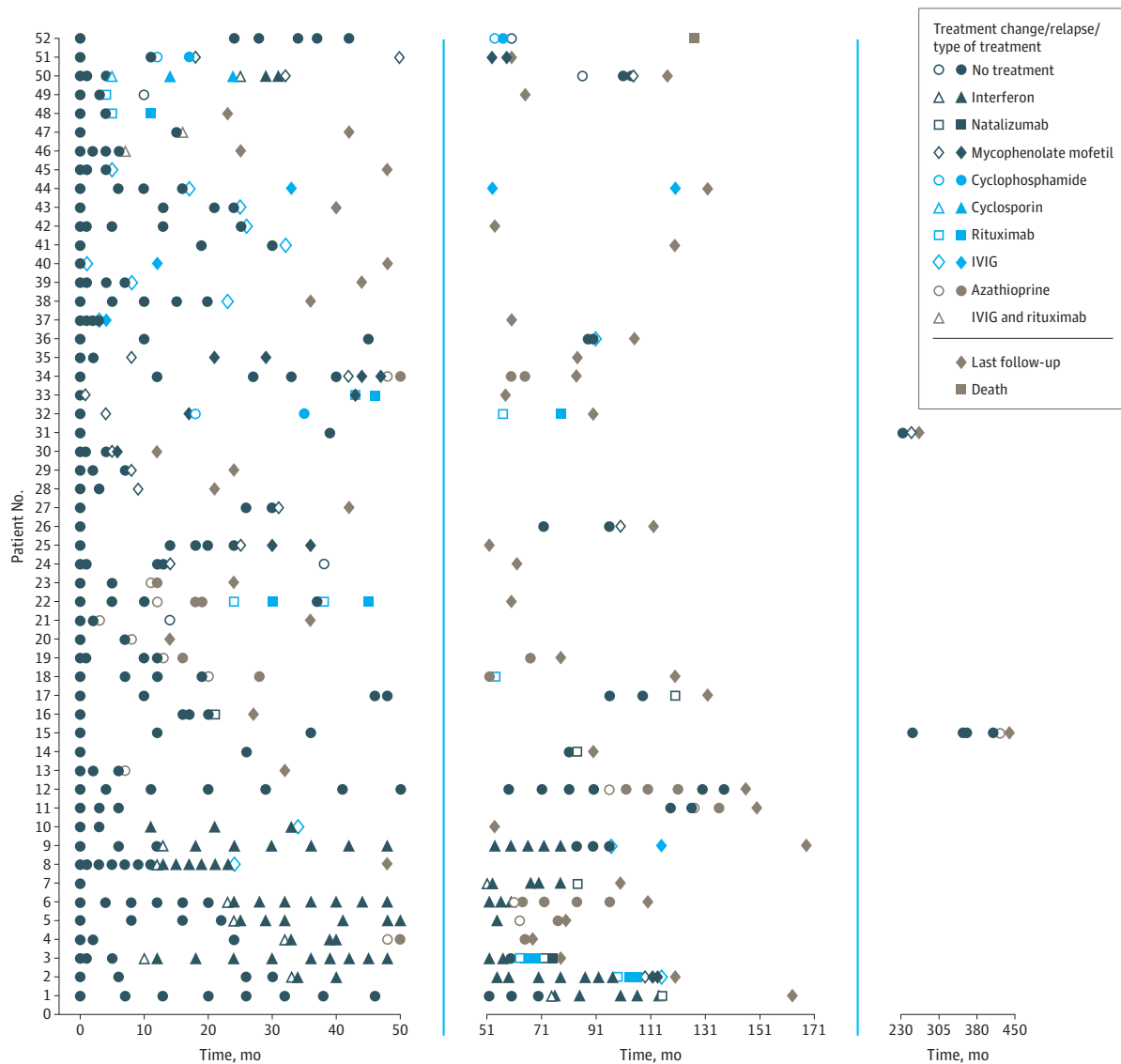
Figure 2. Disease Course in Relation to Respective Therapies

Each solid marker denotes a demyelinating event, with the color in the figure key denoting respective treatment, whereas an open marker denotes initiation of therapy. Patient relapsed while undergoing all treatments, with a total of 127 relapses during treatment reported in the cohort. All patients treated with first-line injectable multiple sclerosis treatment continued to relapse. Twenty-eight patients remained relapse free while receiving treatment; 7 of 15 (46.7%) treated with mycophenolate mofetil, 10 of 20 (50.0%) treated with